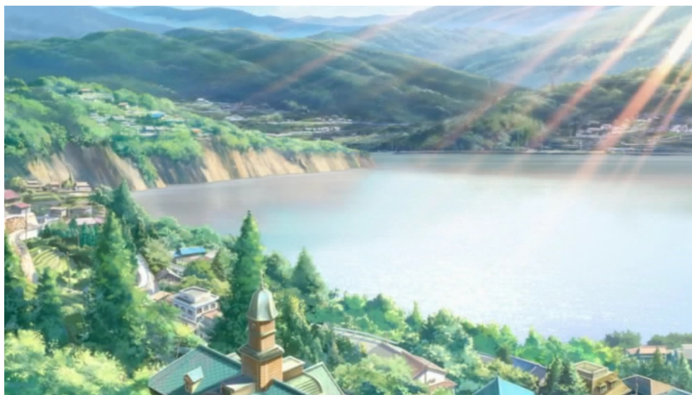
Fig. 1: The townscape of Itomori, a mix of Japanese and Western architecture with some rice paddy fields on the left side. ( Kimi no na wa : 00:32:13; © CoMix Wave Films)

appear, a stereotypical white-collar worker ( sararii man ) who only speaks a few distant words to him at the breakfast table. Taki's social life centers around his classmates and his older female shift leader, whom he has a crush on. Tokyo basically seems like a rather cold and rough place (e.g., some youngsters menace him at his part-time job), but at least friendship compensates for the competitive living conditions in the overloaded metropolis. When Taki suddenly wants to travel to Hida alone in order to search for Mitsuha, a close friend and his female shift leader resolve to accompany him for support.