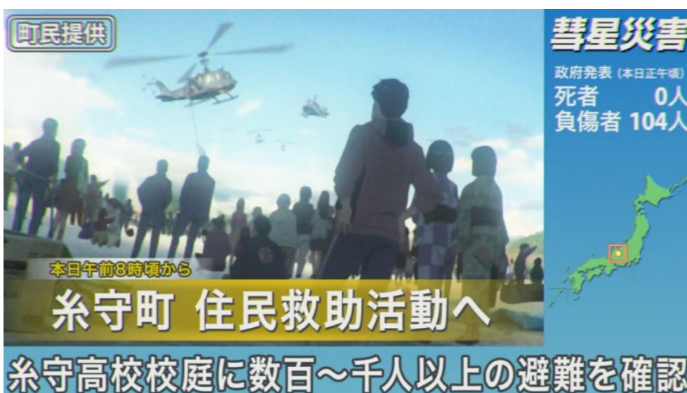
Fig. 5: Very similar to real Japanese news, the salvation of Itomori’s inhabitants is reported; the characters on the upper right say the most important detail: “deaths: 0 persons”. ( Kimi no na wa : 01:35:49;)

huge success of the first Gojira movie ( Godzilla , 1954) is often interpreted as reconciliation from the trauma of war and the two nuclear bombs dropped on Hiroshima and Nagasaki. 35 In this movie, after a long and tough struggle, the Japanese self-defense forces (i.e. the Japanese army) can defeat the gigantic monster Godzilla , which was born from nuclear bombing in the Pacific. Napier concludes: “The film thus offered its immediate postwar Japanese audience an experience that was both cathartic and compensatory, allowing them to rewrite or at least to reimagine their tragic.” 36 Although Gojira seems the most famous example of a fantastic movie that negotiates Japan’s postwar trauma on an abstract level, other media content like director Matsumoto Leiji’s popular science fiction anime franchise Uchū senkan Yamato ( Space Battleship Yamato , 1974–1975) can also be considered in this context. 37