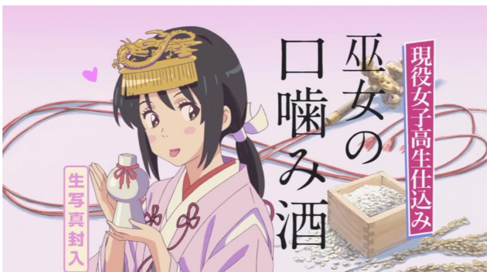
Fig. 2: Mitsuha imaging herself in a commercial for kuchikamizake . ( Kimi no na wa : 00:16:56)

family networks seem just as difficult as in Tokyo at some points. Mizuho's father, for example, has a rather distant and conceited attitude toward his daughter, and some of her classmates actually find kuchikamizake embarrassing and obsolete. The ceremony of producing the rice wine only attracts a few spectators, while the flute and drum music for the ritual comes out of an old radio. The romanticization and fetishization of the "rural" is clearly mocked in Kimi no na wa . The little sister even suggests selling kuchikamizake in Tokyo, which Mitsuha rejects after imagining herself in a ridiculous commercial for it (Fig. 2). I consider this scene a parody of urban people's obsession with urusato -themed rural goods or their consumption, which has indeed become a commercial trend since the early 1990s. 12