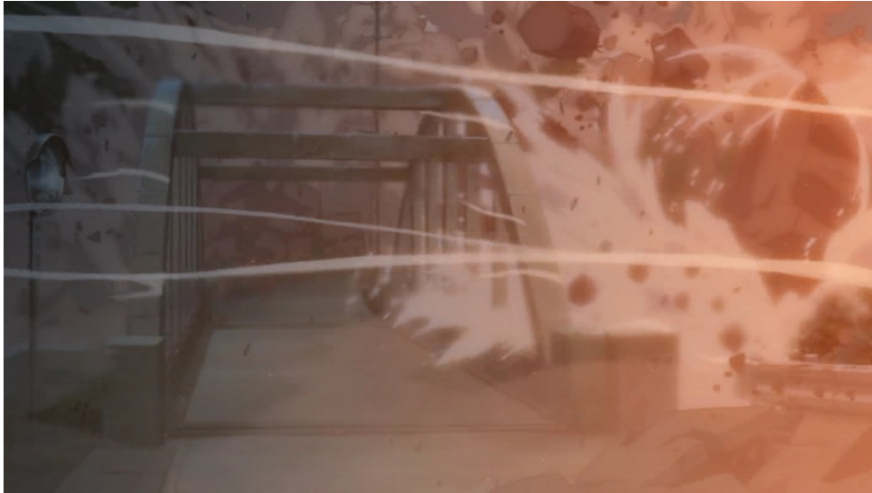
Fig. 4: The tsunami-like wave after the comet's crash destroys a bridge. ( Kimi no na wa : 01:32:21)

modes of emotional catharsis that movie viewers may obtain; one mode is related to “conscious troubles,” i.e. physical or psychological problems like a disease or a trauma. 32 He suggests: “The movie (and other artistic) emotions are associated with an attempt to ‘symbolically’ solve these problems.” 33 I argue that Kimi no na wa offers such a symbolic solution to the collective trauma as well as an emotional catharsis through its alternate storyline.