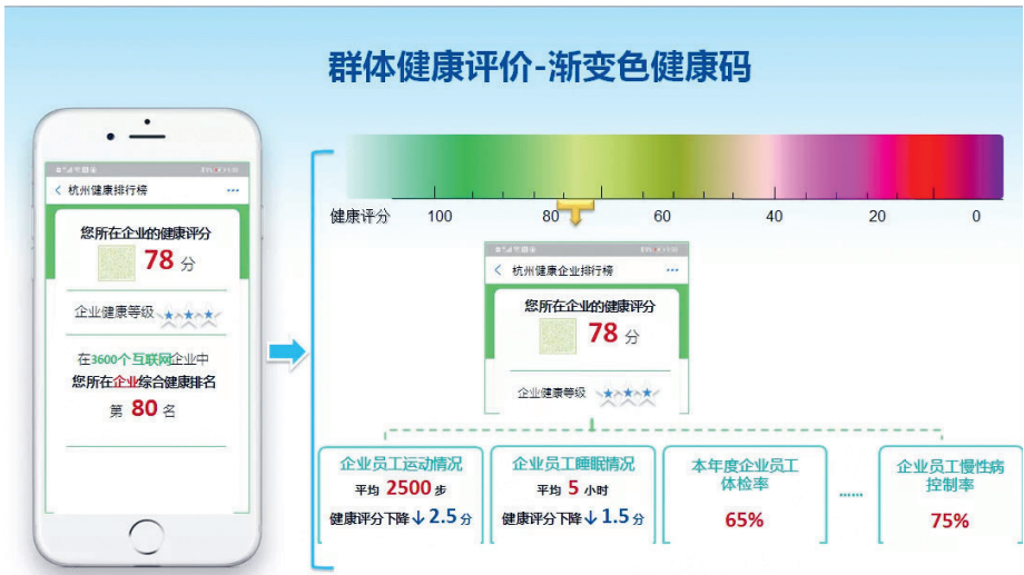
Fig. 2: 根据企业全体员工走路步数、睡眠情况、体检率、慢性病空置率等得出的群体健康评分以及在本地企业中的排名。