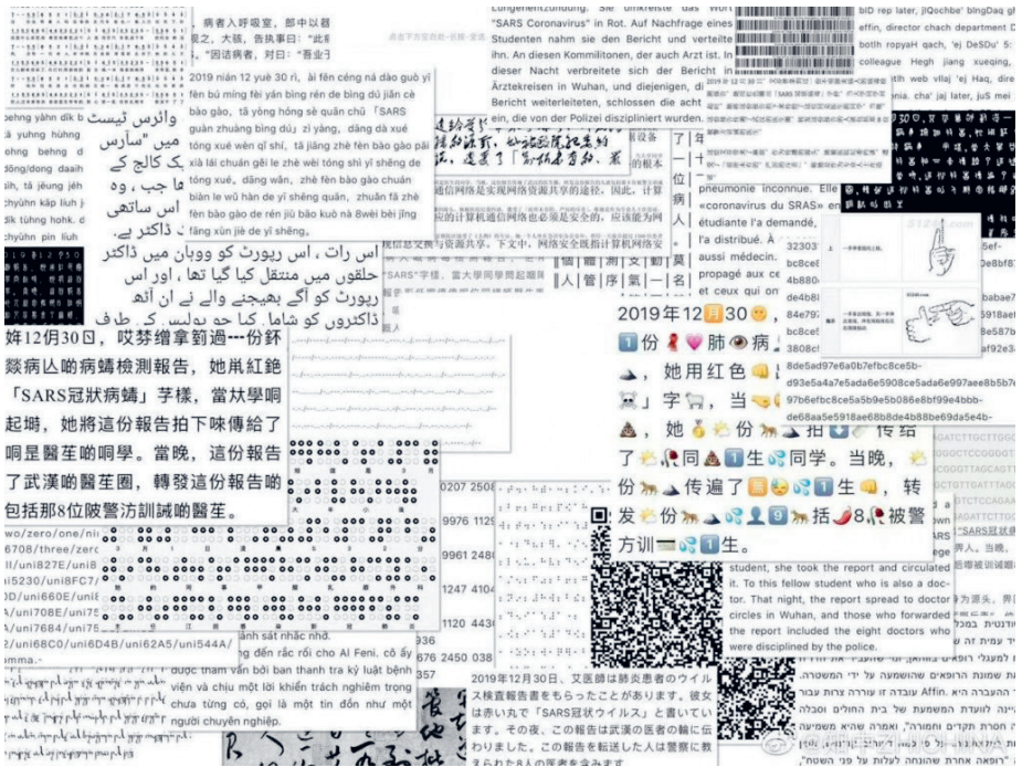
Fig. 1: The circulation of the censored report in different languages. Source: https://www.jixiaokang.com/2020/03/13/2020-03-13-fa-shao-zi-de-ren/