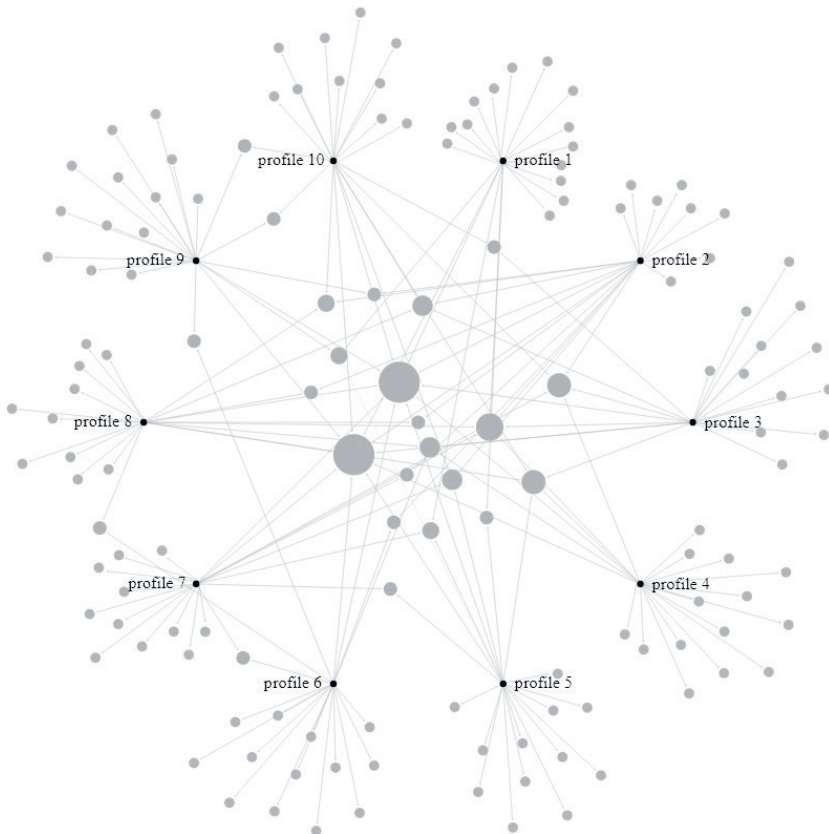
Fig. 2: Risultato dell'analisi con browser "personalizzati".

Per concludere, i video suggeriti, la grande maggioranza in comune, erano tutti afferenti all'argomento del video osservato. A quel punto abbiamo ripetuto l'esperimento, ma utilizzando i browser di uso quotidiano da parte delle studentesse usavano, quindi "inquinato" da innumerevoli traccianti web come ogni dispositivo non adeguatamente pulito con cura.