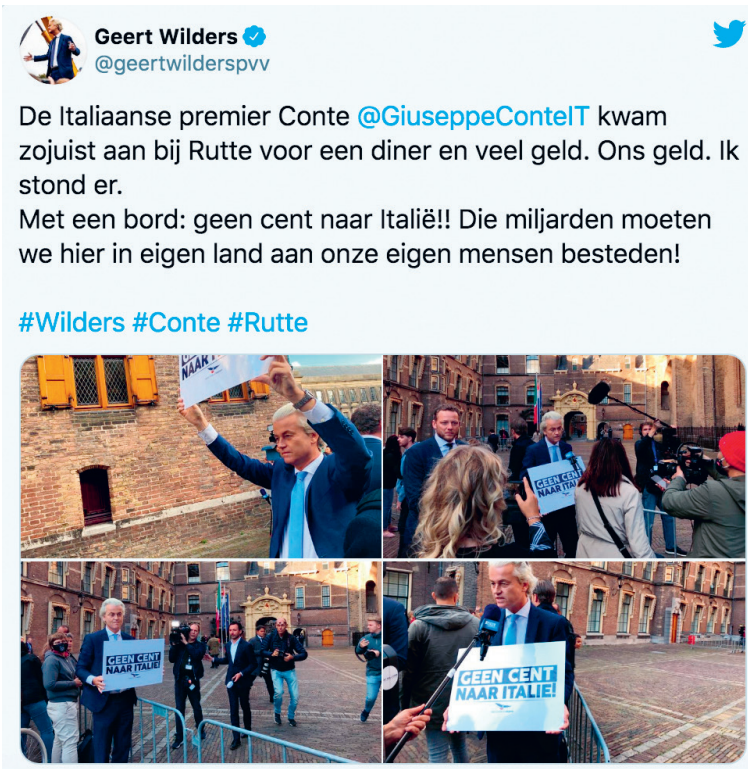
Fig. 1. “Not a Cent for Italy”

of the Parliament by far-right leader Geert Wilders, who raised a sign reading, “Not a cent for Italy.” 2