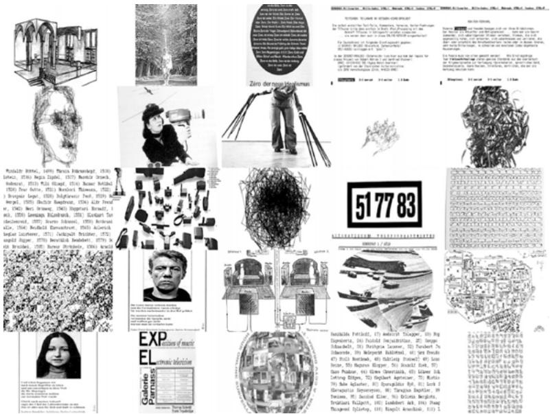
Fig. 2a. First array of presented images. The momentarily watched image is slightly magnified.