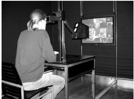
Fig. 1. EyeVisionBot

host the control software. The latter controls and analyses the gaze tracking, accesses the database, and steers the visual output. Simply put, the eye-tracking device detects the viewing direction of the user. With this it is possible, given a display of twenty-five images arranged in a 5 x 5 matrix, to determine which images are looked at and for how