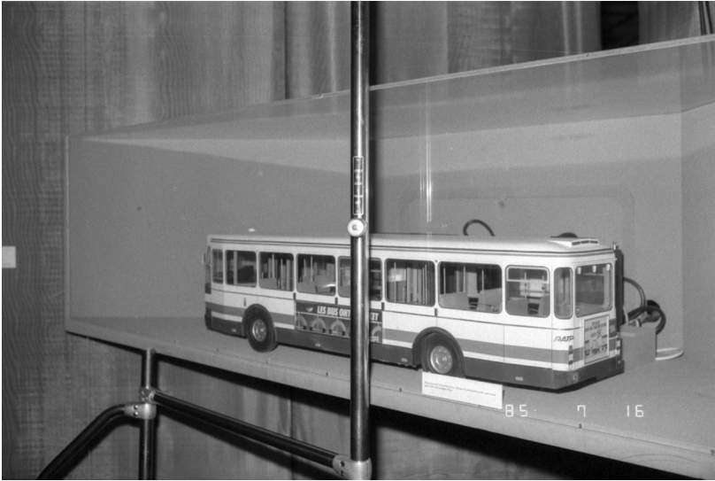
[Figure 9] Jean-Louis Boissier: Le Bus , 1985, installation view, Les Immatériaux , site Visites simulées (Source: Jean-Louis Boissier).

of interconnected cathode-ray screens. But in doing so he came to identify “infographic technologies [which] will likewise force a readjustment of reality and of its representations”. 3 In this respect he mentioned Tactical Mapping System, a videodisc programme that history remembers under the name Aspen Moviemap .