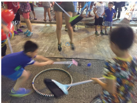
Figure 4/5: Late night engagement in the magic circle of Dragon Polo, Hong Kong (Mong Kok)/ Dragon Polo logo.

Only a few individuals disrupted our play: an old street artist asked us to stop the game every 5 minutes for his performance, for which he had to take a 30 meter in-run through our game field (he jumped through a hoop on a mattress). This gave the game a very spontaneous and volatile touch. At another point, a group of old men started a heated discussion with our Chinese team members. They didn't understand why we wouldn't want to play in a park, where we had more space, which should therefore be more fun for us.