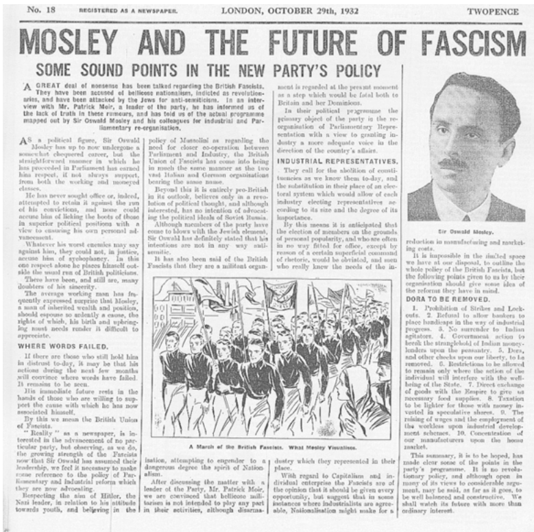
Figure 3: "Mosley and the future of fascism"