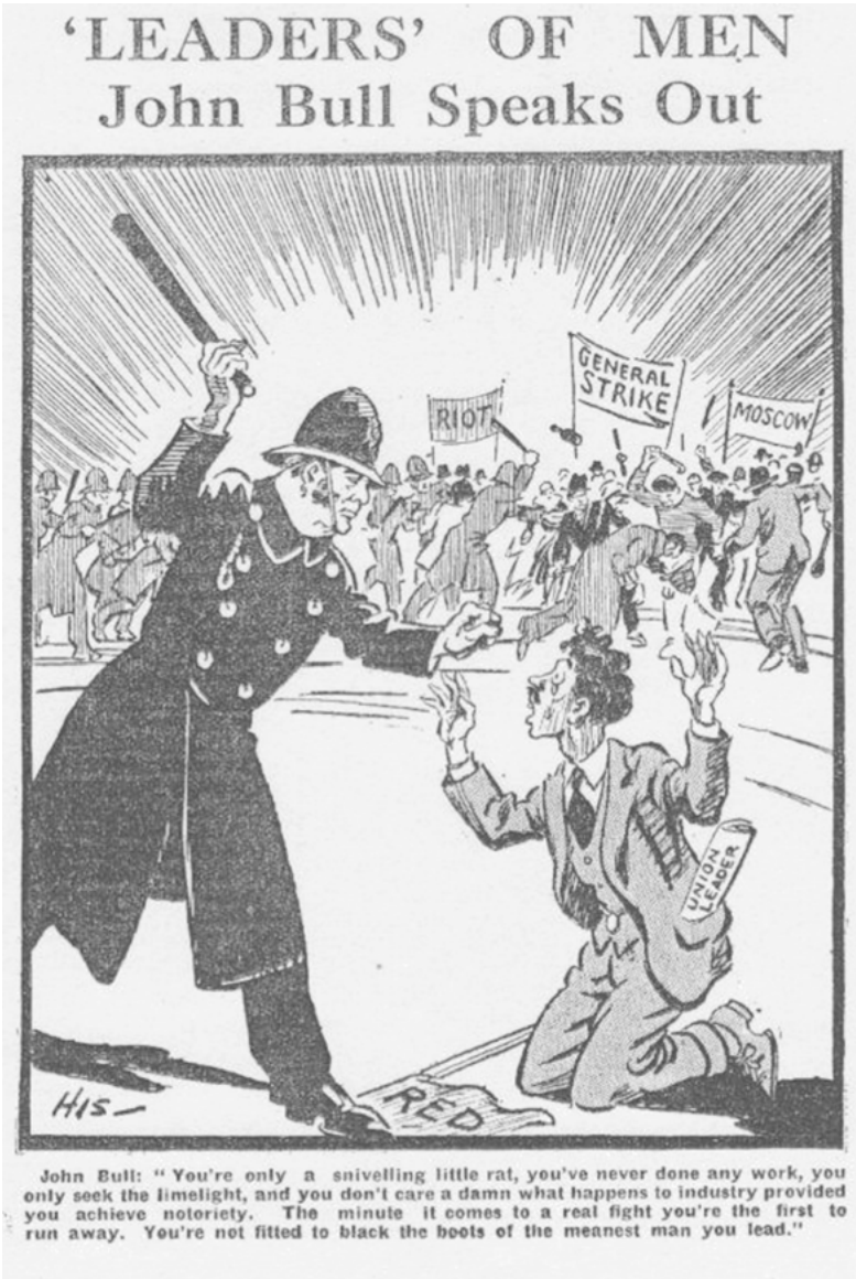
Figure 2: John Bull "speaks" with violence