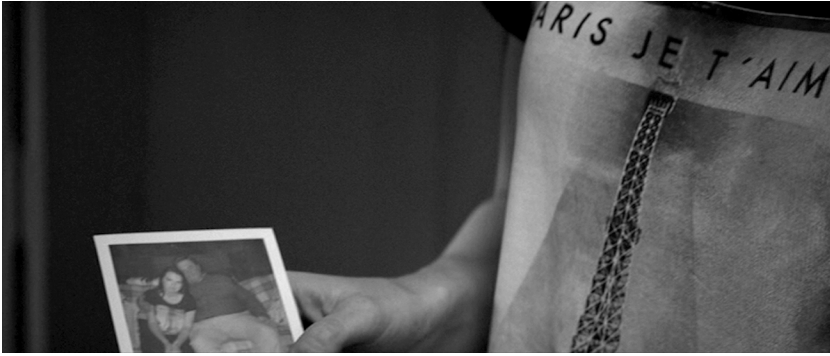
Figure 7.1. 10 Cloverfield Lane . Michelle wears the same shirt as Brittany in the photo.