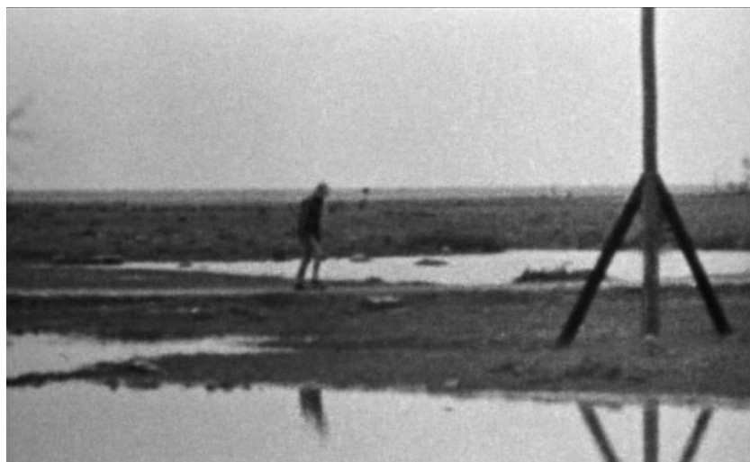
Figure 3.1. The Passion of Anna . The boundary between reality and the real begins to collapse.

falls to the ground as the grain of the film literally disintegrates him. The sound of timpani is heard, evoking the dead horse. As the film ends, the narrator states: “This time they called him Andreas Winkleman.”