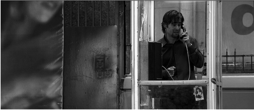
Figure 6.2. Phone Booth . OBEY Giant stickers loom in the background.

too much information as a cinema of excess, Schumacher, in a sense, is forcing the viewer to put on the glasses. As such, the film's exposure of excess explicates not only a dark dimension of the news media and celebrity gossip culture, but also the concern with mobile communication emerging at the turn of the millennium.