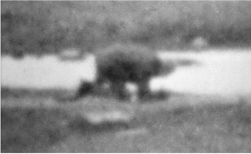
Figure 3.2. The Passion of Anna . Andreas disintegrates.

the zoom in The Passion of Anna finds its object: Andreas. Whereas the flash frame at the end of Wavelength reminds viewers of cinema's secret (the still frame), Bergman reminds viewers of The Passion of Anna's subject: "This time they called him Andreas Winkleman." At the same time, the sound of the ticking clock during the zoom shot and the reference to Andreas's name gestures to the start of the film, suggesting a looping narrative that intimately connects to cinema's still frame flickering over and over into infinity.