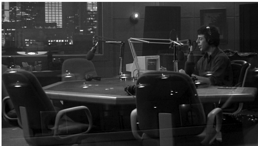
Figure 5.1. Talk Radio . The city looms as a figure of surveillance.

in which Barry is under surveillance by a looming, amorphous public eye. Because Barry stubbornly refuses to shy away from racist and dangerous callers, the confined setting of WGAB transforms into a space of deep uncertainty.