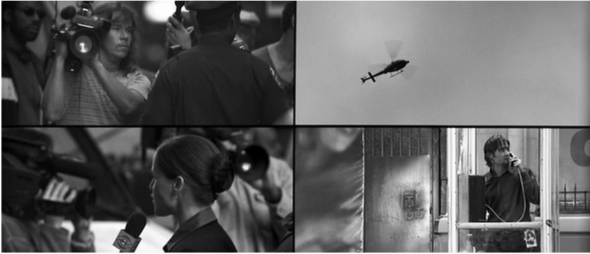
Figure 6.1. Phone Booth . Simultaneous information renders the gaze as a distorting presence.

Caller's knowledge, such as when Stu covertly dials Kelly while talking to the Caller. Kelly's image appears in a split screen as she answers her cell phone. Hearing Stu's conversation with the Caller, she now knows that he is being held hostage by a sniper. Kelly brings her phone to Ramey, which significantly changes the narrative.