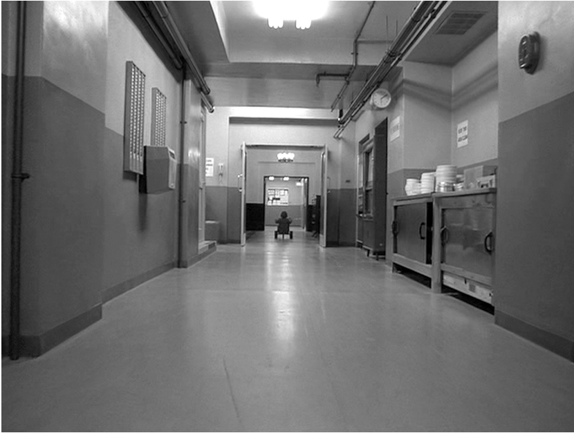
Figure 4.2. The Shining . The camera lingers far behind Danny to suggest something frighteningly unknowable.

states, "Point-of-view structure depends on there being no total view, no transcendental position from which an all would, if only in principle, come into view." 23 Kubrick's expressionistic movement of the Steadicam, wide-angle framing, and sinister soundtrack manifest the excess of the gaze. At the same time, the unattributable bearer of the look suggests the presence of others that exist in the Overlook. Danny's ability to manifest the past confirms what lurks in the corridors and may not just be his imagination. As I will explain in the final section of this chapter, exploring the reverse-angle shot offers a potential clue to uncovering the Overlook's ghostly dimension.