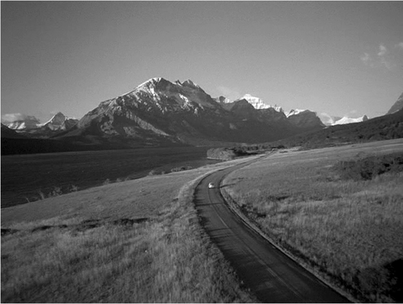
Figure 4.1. The Shining . The unattributable shot suggests something following Jack.

trails off the road, flying over the cliffs as we hear extra-diegetic dissonant sounds of a human voice. As such, the opening images of the film and haunting score are composed with unusual emphasis in order to evoke the notion that “some others exist”—that a gaze not identified with a specific observer lurks around Jack. The unsettling effect of the skulking aerial shots is reinforced by the film’s blue rolling credits (often reserved for the end of a movie), suggesting, again, that The Shining is a circular narrative: the end is the beginning. 22