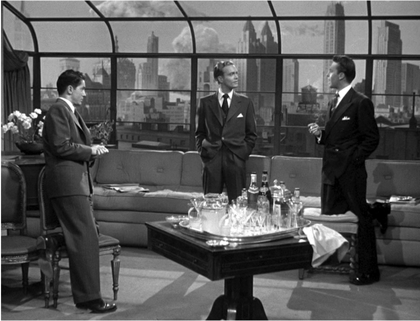
Figure 2.1. Rope . The large penthouse window and cityscape loom in the background.

the details of the cyclorama work in concert with Hitchcock's "real-time" narrative in order to follow Brandon and Phillip's command of space and concealment of the secret.