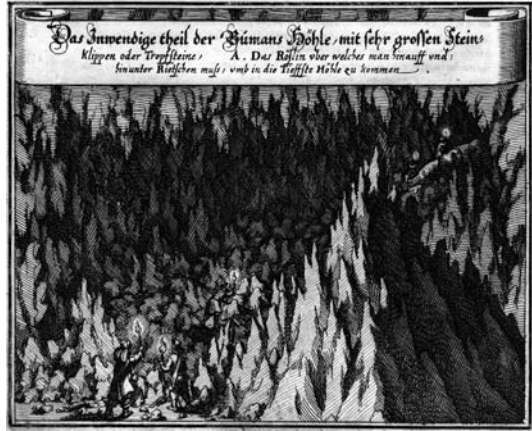
Fig. 1: From the cave to its representation: Merian's view of the Baumannshöhle

Merian's cave is a subterranean version of the world experienced above with its landscapes, ground and horizon and breathtaking views – and significantly, it does not have a ceiling. With the publication of this print coincided the beginning of