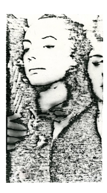
Figure 5 . Marik Boudreau, Untitled , 1984, Monochromatic xerography, 33 x 20 cm.

[...] those who talk about computer art haven't a clue what they're talking about, and confuse the medium with the content, the idea, the result, mistaking the tool for the work of art. Art is not like Formula One, where the car counts more than the driver. (Quaranta 2013: 31-34)