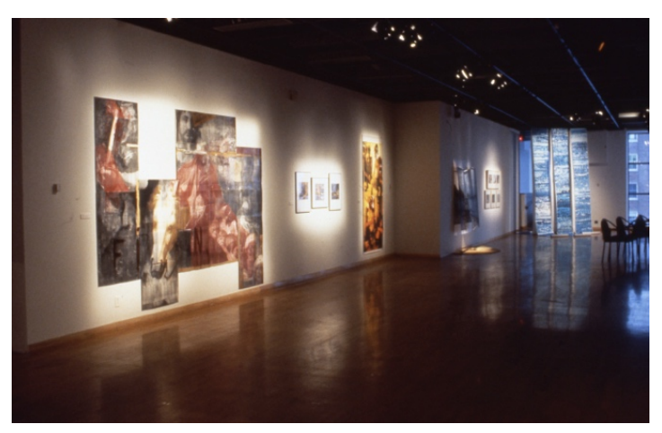
Figure 6 . General view of the exhibition Interconnexions copigraphiques , with the work F.I.N. by Alcalacanales, 1993.

ox , which was a kind of catalogue that worked as a recipe book on the potential applications of this technology.