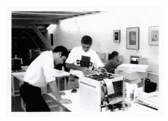
Figure 4 . MIDE team is assembling a photocopy machine's Interface Processor Unit.

first electrographic copy in Astoria on 22 October 1938. That copy consisted of a text written with graphite pencil in which the date and place of the event was indicated: "10.-22.-38 Astoria." The result of his process was denominated Xerography, that is to say "dry writing", because it used dry electrostatic for copying documents. The first electrographic machine came on the market in 1950, but its process was manual until the Xerox 14 appeared in 1959.