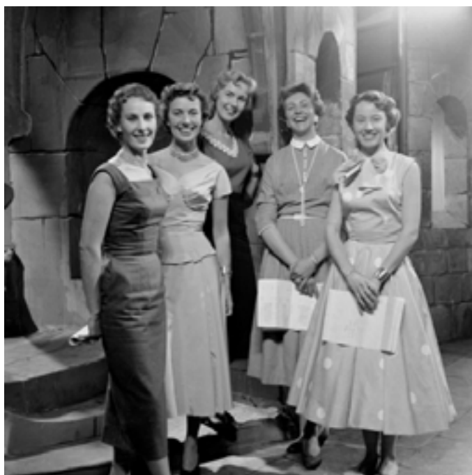
Photo 5: Group photo announcers of Dutch public broadcasters, NTS, 1956

While popularizing the new medium, in-vision announcers had become popular television figures and celebrities themselves, emphasizing warmth, credibility and their 'girl next door' appeal. This was unlike the status of cinema stars that were more often constructed as glamorous and unattainable. Yet, in their acts of self-representation female announcers provoked admiration, supported by their pictures published on the covers of the television guides, in lifestyle magazines and by publicizing clips of their private lives in the public sphere. In the context of modern life however, television announcers performed one particular function that Richard Dyer 40 has attributed to 'stars', namely the holding together of contradictory social ideals. This is to say they represented the middle class ideal of modern life, among other things in speaking the language of the middle class, without any dialect or accent, while at the same time purporting to appeal to all social classes and binding them together. As in the Netherlands each announcer represented one of the existing broadcasting companies, one could argue they also represented the cultural values of the broadcaster they were working for, thus offering a space for the consumption of apparently 'plural' notions of cultural identity.