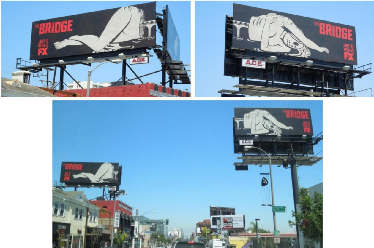
Figure 5. Outdoor marketing campaign for The Bridge in Los Angeles

In several markets, FX promoted The Bridge with a visually aggressive outdoor marketing campaign. In addition, FX held mural contests in predominantly Latino neighborhoods in New York, Los Angeles, Miami, Houston and Chicago. 38 Artists were asked to contribute submissions that would “reflect the collaboration and connection of Latino and American cultures and contest winners were announced the weekend before the July 10 th premiere.” 39