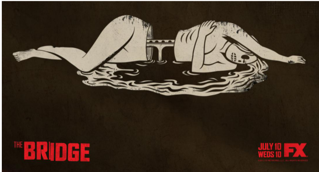
Figure 4. Promotional art for The Bridge (season one). Click here to see the source.

As FX was in the process of ordering The Bridge to series in early 2013, Landgraf positioned the show as meeting some of the channel's long-standing needs. At the Television Critics Association (TCA) winter press tour, he claimed to be "getting a little tired of male anti-heroes" and expressed hope that Kruger and Keri Russell, the female lead in the network's Cold War spy drama The Americans (FX, 2013-), would attract female viewers. 33 Speaking more generally about the traditionally masculine appeal of FX, he said, "From the earliest time that I had the opportunity to start making decisions about what we would put on the air, I have felt really strongly that I don't think FX should be a male or a female brand. I think it should be a brand, like HBO or Showtime, that appeals to both." 34