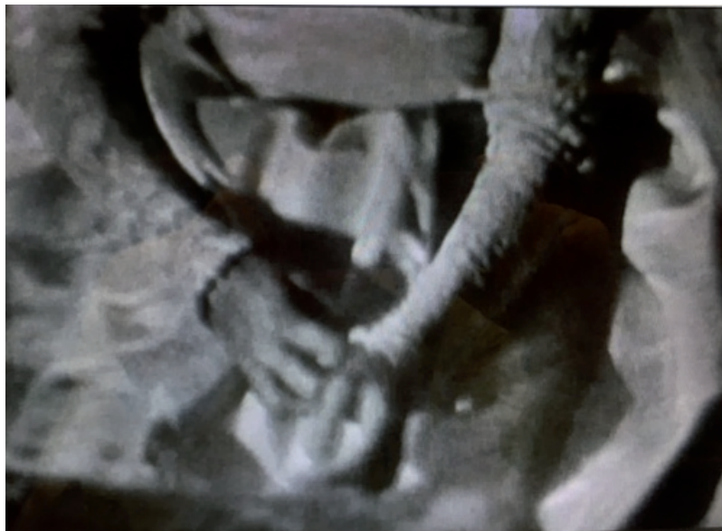
Figure 5. Grace Kelly replacing the handkerchief into her left sleeve during the ceremony as covered by television; screenshot of the 16 April 1966 edition of BBC2's Plunder .