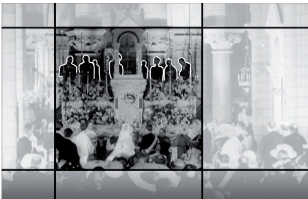
Figure 1. A technical rehearsal took place before the event so that the lighting would clearly illuminate the groom and bride in her ivory dress. Microphone positioning was particularly important for the TV coverage, and priests were recruited to move them when necessary.

The two British newsreel companies, Pathe and Movietone, ended up by showing less than their two minutes' ration of footage from the cathedral. Pathe ran a three and a half minute item with just less than half showing events inside