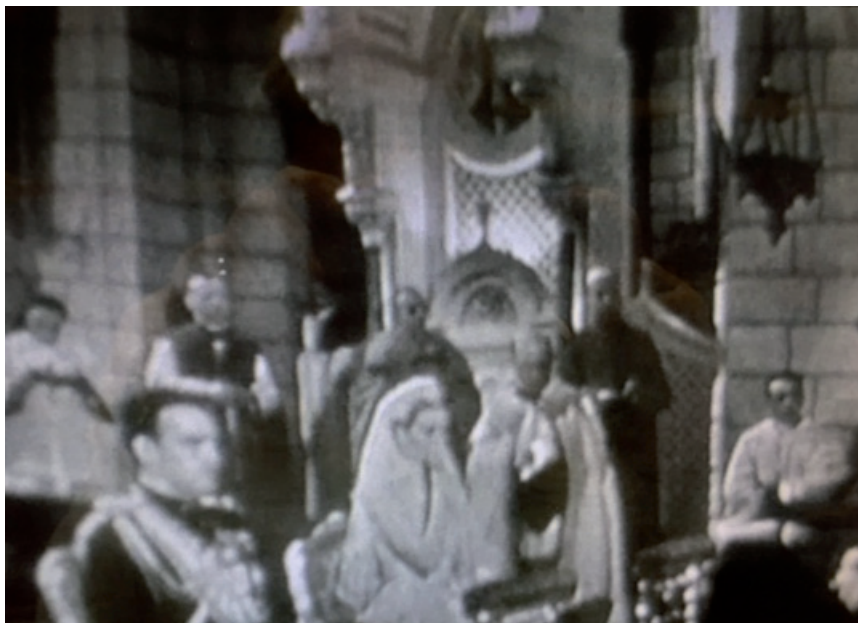
Figure 4. Grace Kelly dabbing at her eye with a handkerchief during the ceremony as covered by television; screenshot of the 16 April 1966 edition of BBC2's Plunder .

of the cathedral, and the key one behind the altar. This one shows the couple from an oblique frontal angle with Grace in the centre of shot. From this new angle, we can see her dabbing at her eye with a handkerchief.