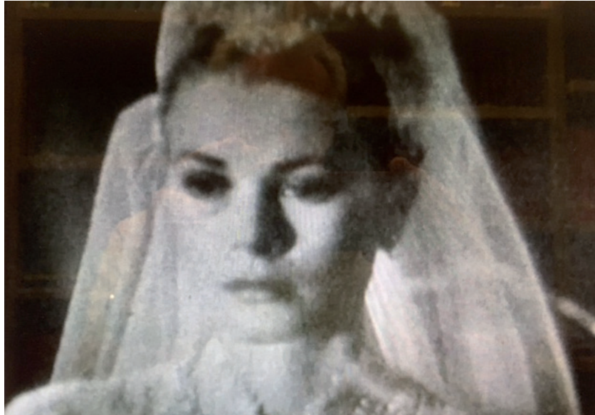
Figure 3. Close-up of Grace Kelly during the ceremony as covered by television; screenshot of the 16 April 1966 edition of BBC2's Plunder .