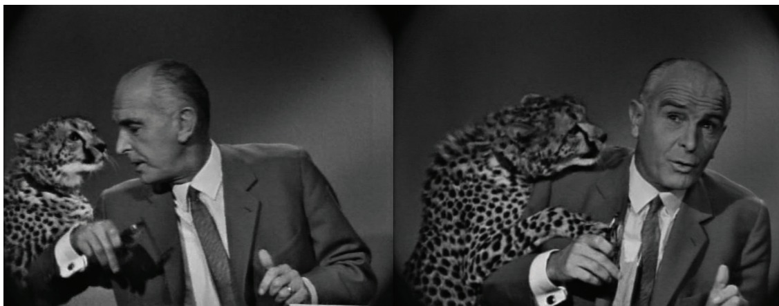
Figure 2. Ein Platz für Tiere , October 23, 1963.