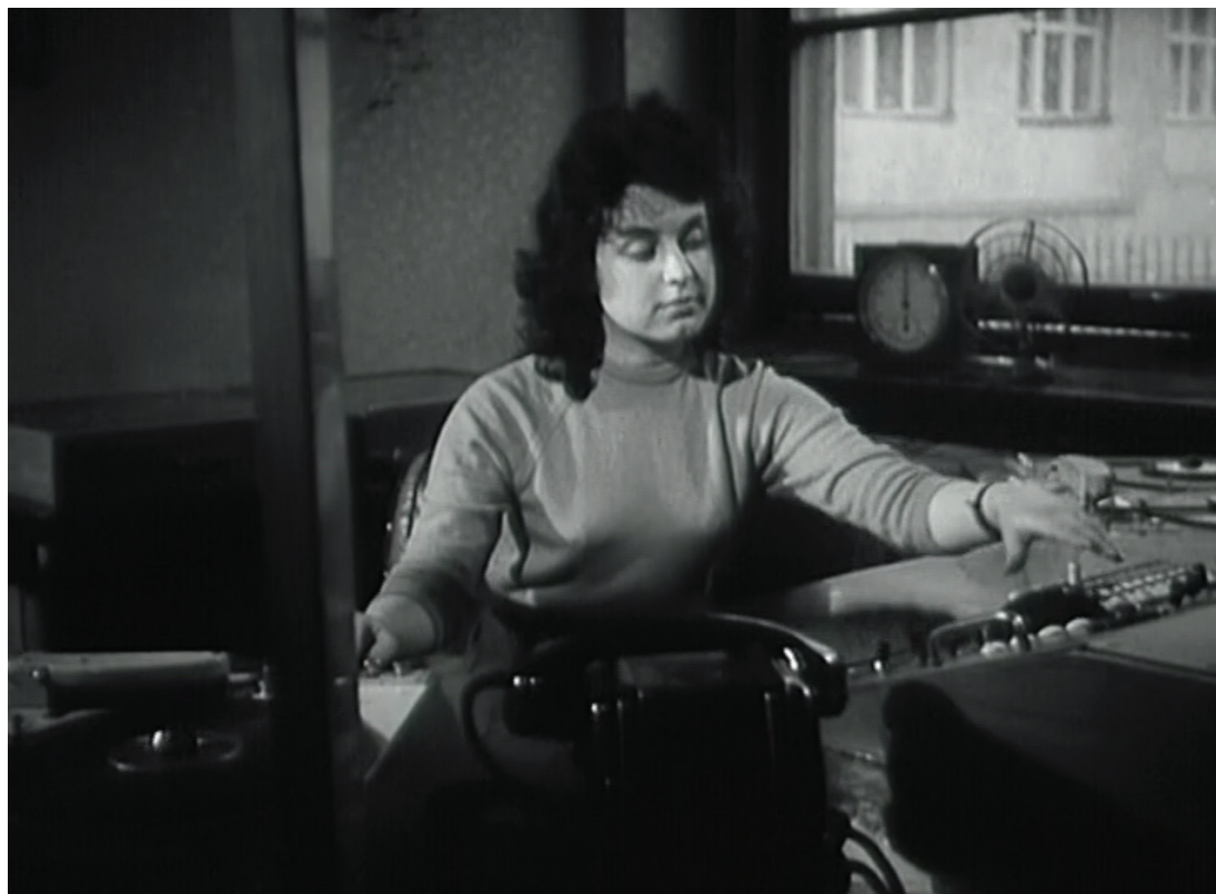
Video 3. The Czechoslovak Newsreel 25 , CT 1961. Go to the online version of this article to watch the video.

creative practices carried out by both men and women in a more or less equal manner, such as technical practices, reading letters, the creative practice of speaking to listeners in a radio studio, and research. This department for the international broadcast of the Czechoslovak Radio at this time broadcasted 30 hours a day in twelve languages, with a large listener response: every year about 50 thousand letters were delivered from all over the world.