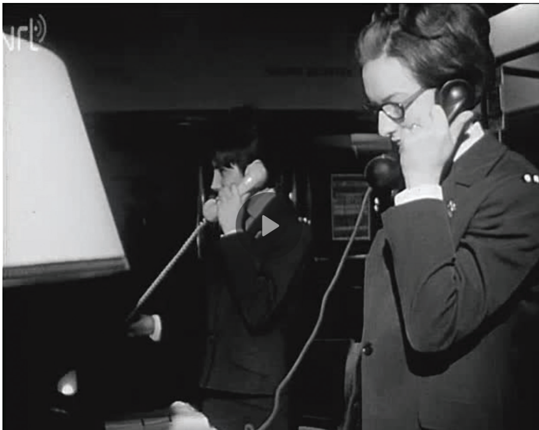
Video 2. Public Broadcast , VRT 1966. Go to the online version of this article to watch the video.

Openbare Omroep (Public Broadcast) (1966) which presents the Belgian VRT's public broadcasting building at the Place Flagey square in Brussels, is a more straightforward 'behind the scenes' documentary, showcasing the generic bustle of an office space over the technical power and know-how of the station. People pushing telephones and paper dominate, with roles between men and women much less visually defined. The moment of focus on technology features a montage of recording technologies ('01:36-'02:02), and while the voiceover suggests this is strongly technical work ('How many technicians spin the records?') the technologies do not look considerably different from that of home technologies – particularly the gramophone record, but also the ¼' tape - plus the operators themselves are barely shown. Indeed, only when the documentary turns to television (circa '02:05), do broad banks of technical equipment become strongly foregrounded - and among the technicians a woman is clearly visible ('03:27). Curiously, about the most consistently gendered technology on display throughout is the typewriter, which is only shown being operated by women.