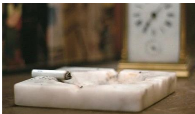
Figure 7. THE CLOCK , Christian Marclay, UK 2010

Jussi Parikka notes that “an archivology [sic] of media does not simply analyze the cultural archive but actively opens new kinds of archival action.” 18 For Parikka, following Wolfgang Ernst, this action seems to be specifically tied to data banks, algorithms and other technical processes. The archive is no longer passive, but is made to generate “new insights” and “unexpected statements and perspectives.” 19 Benjamin’s conception of the image, in conjunction with his insights into media, historiography, and the avant-garde provide a means of thinking of archiveology as a creative practice produced by humans, not machines. Archiveology in this sense involves the interface of human and machine, or as Miriam Hansen has argued in her parsing of Benjamin, a gamble with technology, with the stakes that of the survival of the human senses within the domain of technology. 20 Many filmmakers refer to their work as archaeological, and their films are evidence that media archaeology needs to account for images and sounds, viewers and makers.