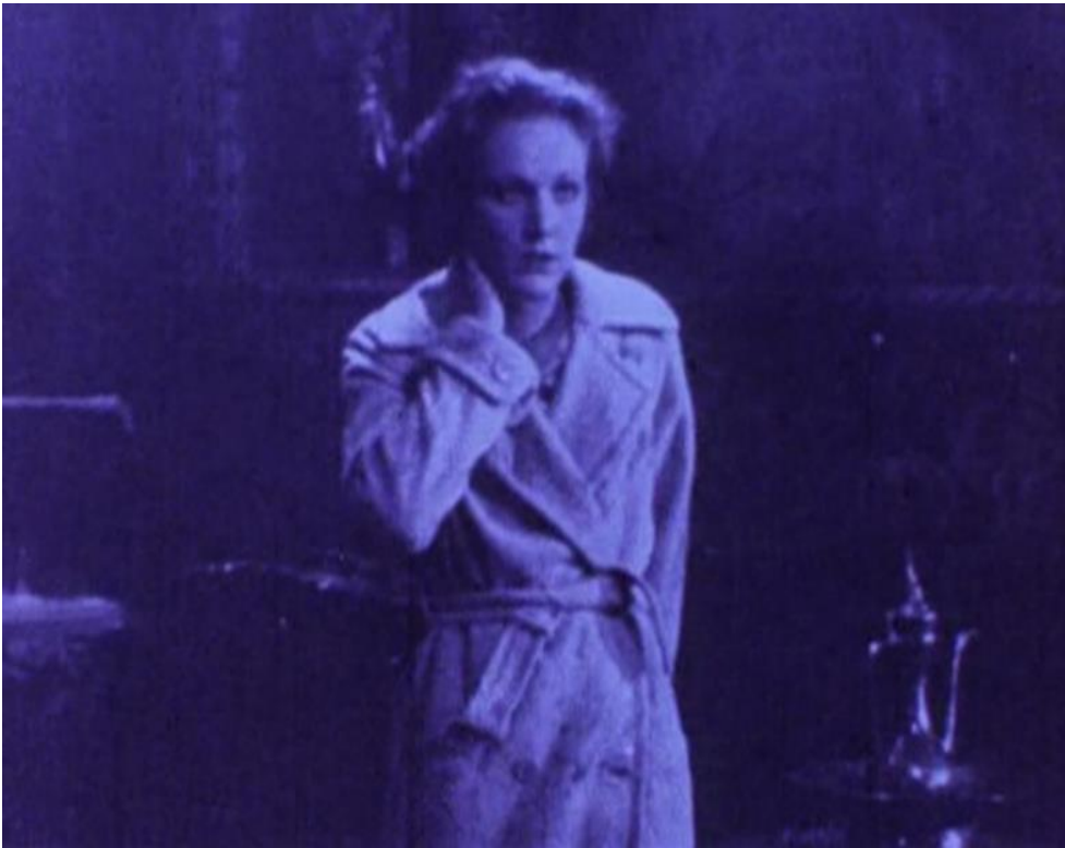
Figure 23. ROSE HOBART, Joseph Cornell, USA 1936

Critical cinephilia, in other words, should theoretically enable us to restore the dimensions of affect, enchantment, pleasure and emotional investment to film studies, without abandoning the theoretical goals of cultural critique that informed the critique of narrative pleasure. Instead of a deterministic, mechanical model of pleasure, perhaps we can find a more selective and subjective means of connecting with narrative cinema.