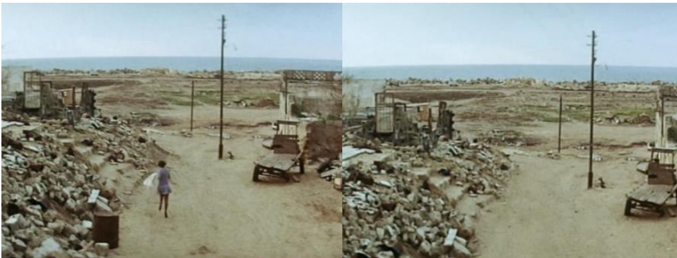
Figure 10. RECOLLECTION , Kamal Aljafari, D 2015

Digital cinema is an unreliable cinema, but once we give ourselves up to the performativity of visual language, the falsification of the image can be used in creative ways. For example, Kamal Aljafari's RECOLLECTION (D 2015) is made from Israeli feature films shot in Jaffa. Using digital effects, Aljafari has removed the principle actors from the locations, leaving behind only the streets and buildings, many of them ruined by years of conflict. He lingers on the figures on the periphery, zooming into close-ups of Palestinian extras that he finally, at the end of the film, suggests may be relatives and acquaintances. The images are rendered inauthentic due to his magic tricks, but then given a new reality through his retrospective assignation of names and characters. RECOLLECTION is a film haunted by ghosts, memories, and a history of violence and Occupation. The ruined city echoes with an emptiness that the viewer is compelled to fill with imagination, and a recognition that the city is much older than the past century of conflict. Aljafari projects himself onto the archival materials in a destructive, poetic, and very personal way. Digital tools have only amplified the means by which images can be 'played' with and yet a film like RECOLLECTION points toward the potential even of destroyed and ruined archives to be remade as new ways of knowing the world.