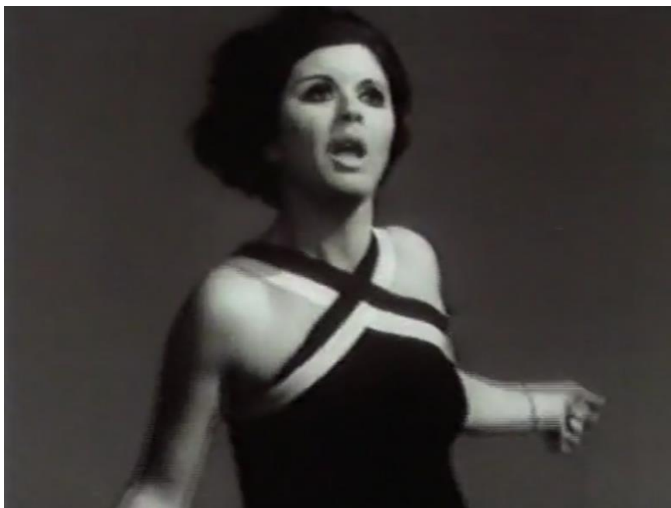
Figure 8. THE THREE DISAPPEARANCES OF SOAD HOSNI , Raina Stephan, LBN/F 2011

At the same time as filmmakers are recycling sounds and images in new ways, museums and film archives are also undergoing significant change in the digital era. In 2012 the EYE Museum in Amsterdam launched a series of innovative strategies for integrating film practice and production with film restoration and heritage. 21 Filmmakers such as Gustav Deutsche and Peter Delpout have been invited to use film fragments from the Netherlands Film Archive for new work; and through online digital platforms, the general public has also been encouraged and enabled to rework material from the film archive. Archivists are reaching out to filmmakers to make the film archive accessible, and to bring it to life. Meanwhile, media artists such as Christian Marclay in THE CLOCK (UK 2010) and VIDEO QUARTET (USA 2006) and Raina Stephan in LES TROIS DISPARITIONS DE SOAD HOSNI ( THE THREE DISAPPEARANCES OF SOAD HOSNI , LBN/F 2011) are sampling the archives of popular culture, challenging the conventions of curation and provenance that have historically governed museum practices. These new relationships between filmmakers and museums and galleries point to a new role of the moving image in the refiguration of filmed history and the history of film. 22