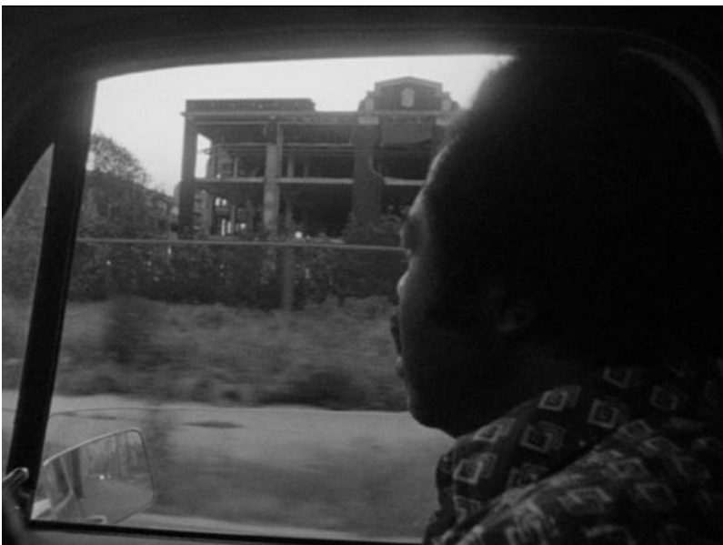
Figure 18. LOS ANGELES PLAYS ITSELF , Thom Andersen, USA 2003

Andersen’s narration in LOS ANGELES PLAYS ITSELF borrows some of the postmodern critique of image culture, but complicates it with a recognition of the untimeliness of historical disjunction and displacement. By organizing his cinematic collection around the use and reuse of specific L.A. locations, Andersen evokes a key principle of archival film practices. He says: “If we can appreciate documentaries for their dramatic qualities, perhaps we can appreciate fiction films for their documentary revelations.” 39 Extracting a sense of place from the multitude of films set in Los Angeles, Andersen reveals cultural significance precisely by transforming Hollywood films into archival fragments.