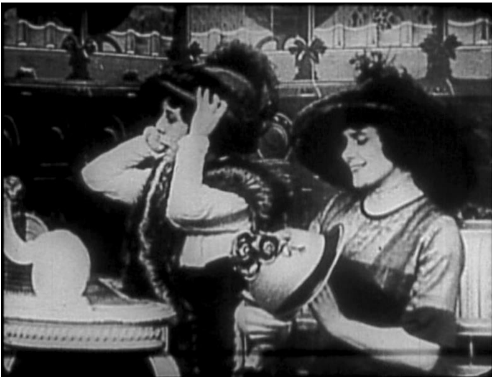
Figure 14. PARIS 1900 , Nicole Védère, F 1947

The city, like the archive, is a living, breathing entity as ‘documents’ are continually added, and more importantly, continually ‘re-discovered’. The surface of the archive is now; its depths are passages to the past. Thus, it is always instructive to return to archive-based films, to be able to discover again what was rediscovered in the past. One of the first compilation films made in the postwar period is PARIS 1900 (F 1947) by Nicole Védère. This film has been largely overlooked by film historians, perhaps because its director, Nicole Védère, made too few films and was the wrong gender to become recognized as an important French auteur. It may also have been overlooked because in 1947 it challenged the usual paradigms of film classification. Jay Leyda recognized it in his book Films Beget Films , and he situated it within a history of such filmmaking that drew primarily on newsreels. 30 However, Védère takes the compilation format a substantial step forward by combining clips of fiction film footage with photographs, newsreel and actualité footage, and by the scope of her archival research. In addition to film libraries, she repurposed imagery from personal collections, flea markets and other sources including garrets, blockhouses, cellars, garbage bins and even a rabbit hutch. 31 In other words, PARIS 1900 expands the concept of the archive and ‘official’ history to include many other histories that were recorded on film and subsequently abandoned as inconsequential.