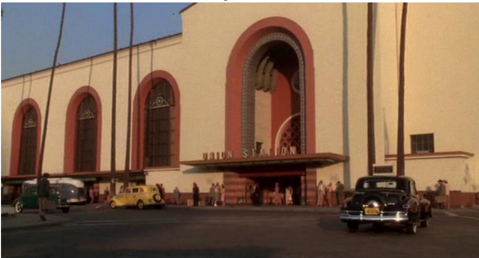
Figure 16. LOS ANGELES PLAYS ITSELF , Thom Andersen, USA 2003

Another important example of a city film that draws on the archive is LOS ANGELES PLAYS ITSELF (Thom Andersen, USA 2003), which director Thom Andersen describes as a "city symphony in reverse." 37 Like Védres, Anderson relies on voice-over narration that incorporates a commentary on the image into his compilation. Both these films drive home the point that cities are places where films are often made, and thus amongst the waste they create are the ruins of their own self-image. Thomas Andersen's 2003 film LOS ANGELES PLAYS ITSELF is an attempt to separate the virtual city of images from the 'real' city of history, an attempt that is ultimately doomed to failure. Andersen's essayistic narration is a critique of Hollywood and the ways that the film industry has appropriated Los Angeles for its various nefarious, fantastic, and duplicitous ends; but it is also a melancholy ode to a city that has had to continually remake its own history in the face of its simulacral servitude to the dream factory. Los Angeles is a comparatively young city, burdened with its own lack of historicity. The deep irony of LOS ANGELES PLAYS ITSELF is that Andersen betrays his own obsessive cinephilia with his vast knowledge of film history, displayed in a brilliant montage of excerpts from genre cinema, auteur cinema, art cinema, and independent cinema.