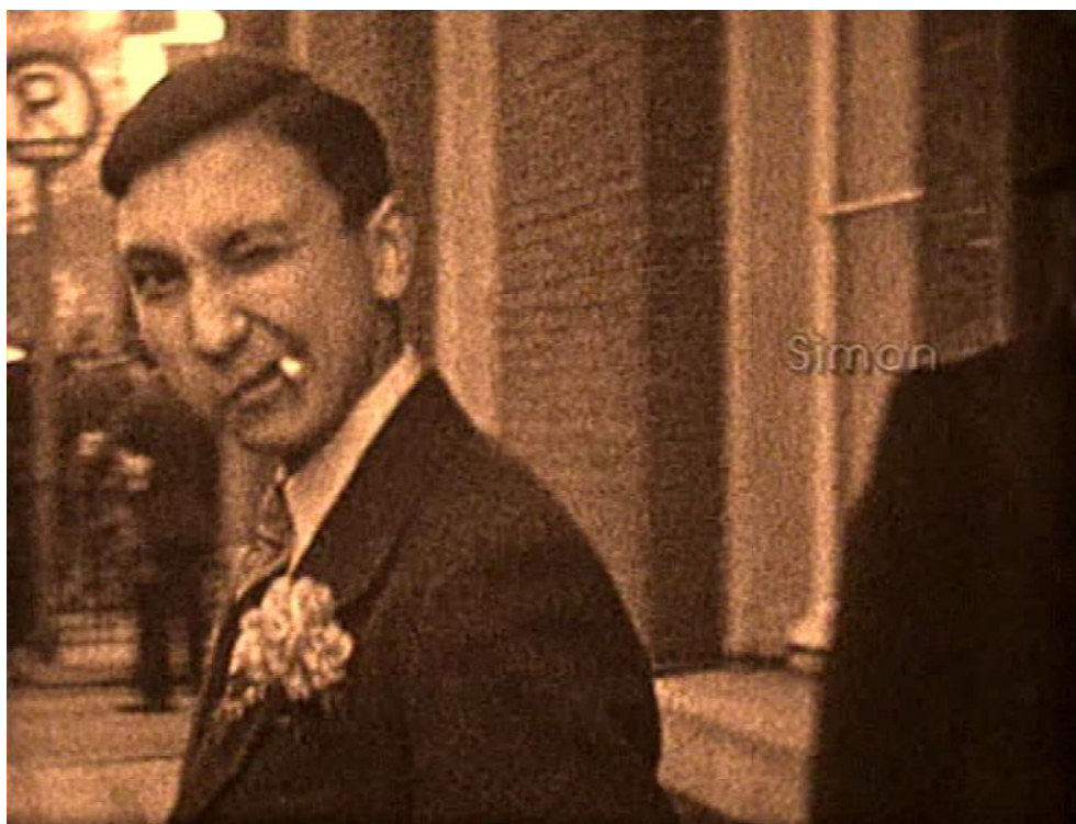
Figure 5. THE MAELSTROM , Peter Forgács, NL 1997

Underlying much of the rethinking of archive-based arts after postmodernism is a recognition that images are constitutive of historical experience, and not merely a representation of it. For example, Emma Cocker argues that archival film practices can produce “empathetic—even resistant or dissenting—forms of memory, a progressive politics.” 13 She describes “ethical possession” as a mode of borrowing from archives for discourses of recuperation and resistance. Notwithstanding the vaguaries of copyright law, appropriation needs to be understood as a form of borrowing that can open up new practices of writing history, and conceptualizing the future. 14 Cocker describes a “paradigm” shift in the use of archival materials since 1990.