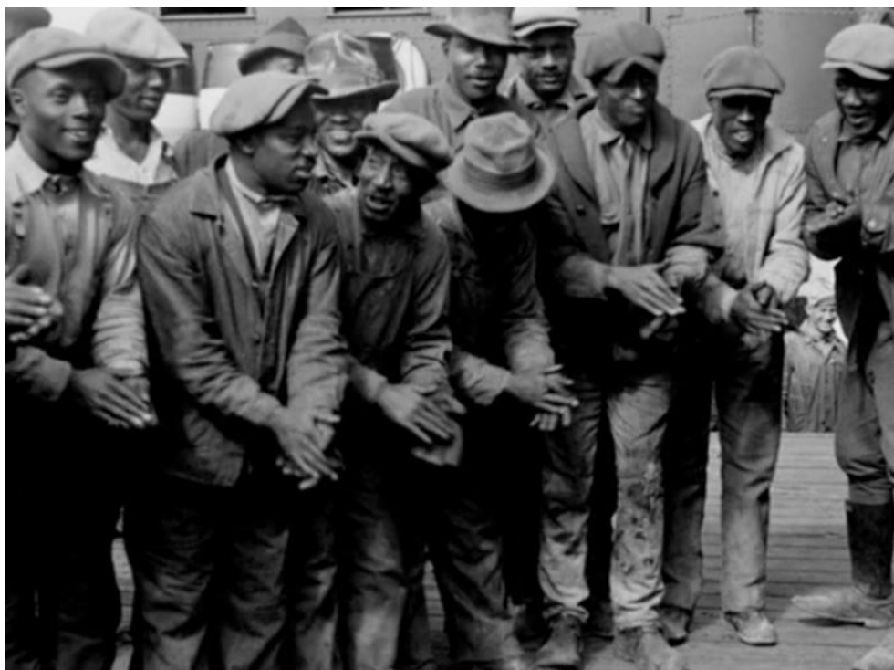
Figure 9. THE GREAT FLOOD , Bill Morrison, USA 2012

For example, Bill Morrison's film THE GREAT FLOOD (USA 2012) comprised of footage of the Mississippi disaster of 1927 is edited without narration, allowing the archival images to come alive with their own effects, augmented by a subtle jazz guitar soundtrack by Bill Frissell.