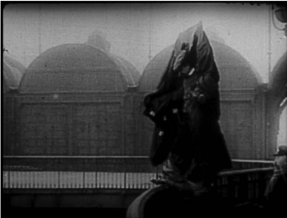
Figure 15. PARIS 1900 , Nicole Védère, F 1947

At the centre of the film is the spectacular death of the Birdman, Franz Reichelt, leaping to his death from the Eiffel Tower in 1912. Captured by Pathé newsreel cameras, this image is emblematic of the vulnerability of the past to teleological narratives of success in which an aviator such as Bleriot is a hero and poor old Reichelt is forgotten. If Védère manages to redeem the Birdman as a hero of an earlier age of the spectacle, her film is arguably consistent with Benjamin’s utopian hope for a flash of something transformative to emerge from the ruins of the past. Benjamin specifically insists that this spark can only be detected within a “constructed” history that articulates not empty time, but time filled by “Jetzeit” or ‘now time’. 34