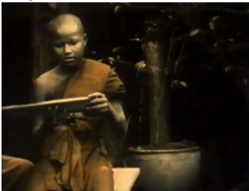
Figure 2. FROM THE POLE TO THE EQUATOR, Angela Ricci-Lucchi/Yervant Gianikian, I/D 1987

In my book Experimental Ethnography , I wrote about found footage filmmaking in terms of apocalypse culture. 4 In 1999 it seemed as if this mode of film practice was preoccupied with 'the end of history' and the promise that Benjamin held out for cinema had failed to be realized. Seventeen years later, as archival film practices have become more prevalent in mainstream culture, and in experimental media, I am more optimistic about the cultural role of audio-visual appropriation. One key change has been a shift in theory and practice to the recognition of the research function implicit in archival film practices. 'Found footage' links the mode to surrealist practices of accident and recontextualization, but negates the extensive searching that sustains the practice. Recognition of the search function in archiveology highlights the role of the moving-image archive, and its transformation in digital culture. The filmmaker is not unlike the archaeologist who 'finds' things and is able to recognize their cultural value. Whether their search is conducted by algorithm, or through files or film cans, every find for the filmmaker is a lucky find when it can be recombined with other images to create a new experience and even new knowledge.