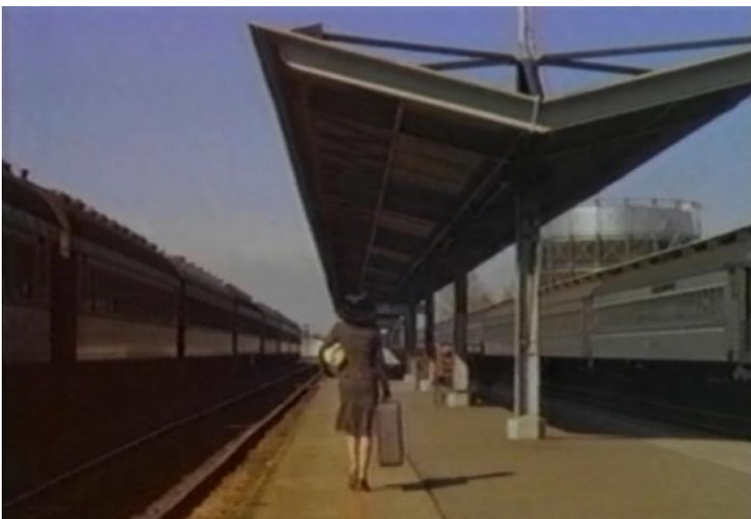
Figure 20. PHOENIX TAPES , Christoph Girardet / Matthias Müller, D 2000