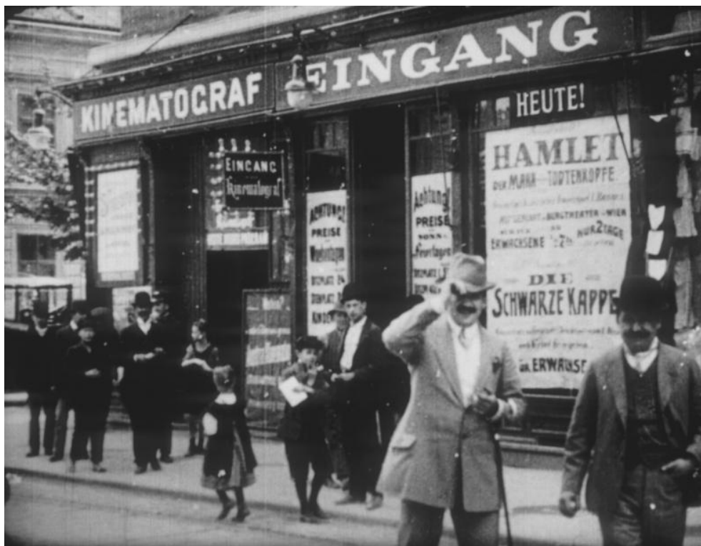
Figure 3. WORLD MIRROR CINEMA/WELT SPIEGEL KINO , Gustav Deutsch, AUT 2005