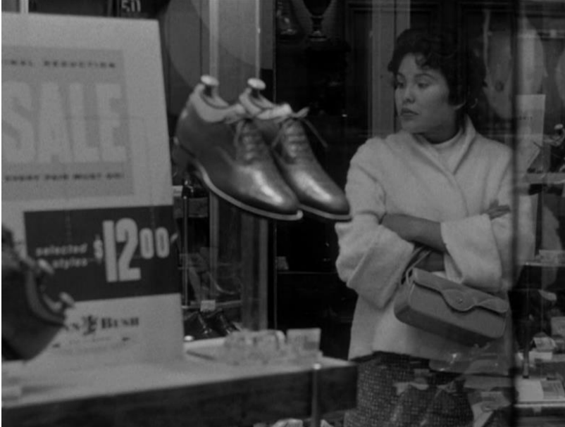
Figure 17. LOS ANGELES PLAYS ITSELF , Thom Andersen, USA 2003

especially since the focus is almost exclusively on the postwar city—and yet it is an excellent example of film criticism in the form of archiveology. Moreover, it has had a direct impact on film history, in its recovery and redemption of THE EXILES (USA 1961) that had been more or less ‘lost’ until Andersen ‘found’ it and included it in his film. 38