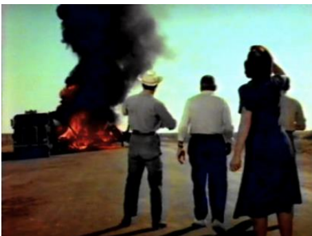
Figure 21. HISTOIRE(S) DU CINÉMA , Jean-Luc Godard, F 1989–1999

Cohen is led to inquire how allegory fits into this schema, and concludes that because it describes the commodity form, “it cannot grasp the palpable way in which the commodity form ‘appears’.” 47 The critical method that Benjamin assigns to profane illumination and the dialectical image could not yet be performed from within the phantasmagoria itself during his lifetime. If the 19 th century phantasmagoria is an important predecessor of narrative illusionism (and Jean Baudrillard’s Simulacra in turn), then critical cinephilia may be the archiveological method of demystification that neither Cohen nor Benjamin were able to recognize.