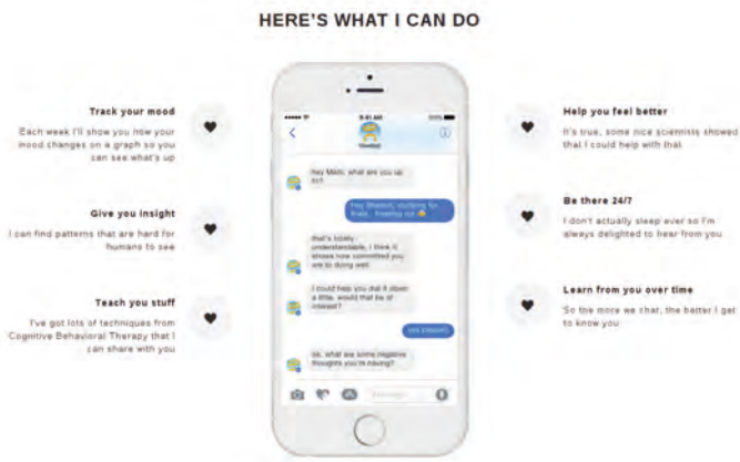
[Figure 1] Screenshot woebot.io/#features

is not a psy-analyst and there is a cruel displacement at play (see Figure 1). The bot's possible answers rely on datafication of the subject's life. But this is not a mirror. Datafication is not representation, but only the production of dividuals, massive amounts of data points that can arbitrarily be combined. Second, the relationship between a subject and this bot app is heavily determined by the relation that subjects and their smart phones are engaged in and its degree and kinds of intimacy. This includes such basic and elementary effects as the screen's brightness and glow, which affects not only infants, but adults, too. And this goes up to the power relations that the subject as the apparent master of the phone cultivates and enjoys in this psy-setting.