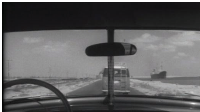
Figures 1 and 2. Journalists report: Nothing new at Suez Canal.