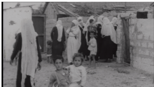
Figure 8. At the UNRWA Camp in Storebeach.

The Tagesschau not only reported on the war itself, but also on the activities surrounding the actual fights. Several pictures were taken from a bird's eye view and showed troop movements and similar activities, and cameramen often included camera-rides by car or plane in order to present a larger context. The 15 November 1956 report displayed a special form of imagery by application of hand cameras, a clear distinction from the newsreels, which generally used cameras on tripods for steady images 46 : in those segments, the camera view wanders over rows of captured Egyptian tanks and missiles or it zooms in on particular details. In several shots, the camera begins with an exposition (long shot) and then zooms in via a medium long shot to finally zoom in to one particular detail with a close up shot on munitions boxes. The corresponding news-text explains that these captured Egyptian weapons are intended as supplies for Israeli troops. To secure transport routes for the captured weaponry, a railway segment had to be repaired – the camera shows the hard work in bright, hot sunlight. But among all these images of weapons and struggles (see Figure 9), some snippets also show civilian people, e.g. a woman carrying a basket (see Figure 10), or a soldier observing a young woman's notes, in order to provide an impression of daily life in such a situation.