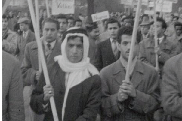
Figure 5. Protest and mourning for the incidents in Egypt and Hungary.

At the peak of the conflict (just one and a half months later), cameramen took pictures directly by accompanying British soldiers in the Egypt city of Port Said. 44 It is known from the text that civilians were sent from the streets when the house-to-house fights started (see Figure 6). So, the streets must have been empty. However, the film showed not only soldiers, but also injured civilians (see Figure 7). In the film, symbolic images were used – often-recurring visual metaphors for war and flight that are still used today, such as the images of walking feet that symbolize the suffering and misery of an invaded country and its people.