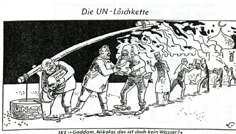
Figure 3. Caricature presented in a 1956 public opinion survey [Goddamn it, Nikolai, that isn't water!].

The 1956 research by Allensbach Institute for Public Opinion Research shows that only 28% of viewers had never watched television before (i.e. in the homes of friends or relatives, in restaurants, in shop windows). Only 3% of those who had watched television had their own television set, 47% watched in a restaurant and 22% watched television in a shop window. 21 Hans-Joachim Reiche, author and editor of the ARD broadcasting corporations since 1949, stated: "Television allows viewers to evaluate processes in a way they have never seen before and makes it easier for them to comment". 22 Young people in particular could form new political views by developing an understanding of the world first. The television experience became a natural part of the world view. 23 The survey showed that young and middle-aged people were particularly interested in the television offer, especially families (79% of them were married). It is interesting that those who did not have a high school education were particularly fascinated by television (63% had elementary school diploma, they were workers, employees, self-employed). 24 Regarding the assessment of the role of the USSR, 40% of the respondents understood the caricature right and 19% misunderstood it completely (see Figure 3). 25