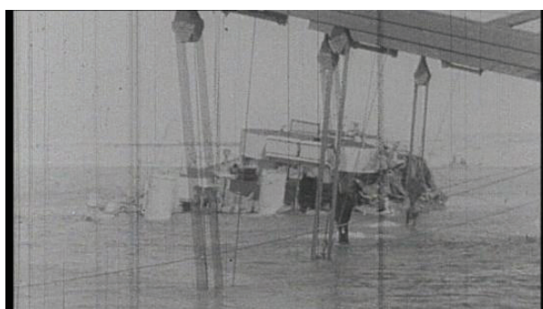
Figure 12. Suez Canal passable again.

What is interesting in this case, is the fact that the cameraman must have been on board of one of those ships in order to take close-ups of jacks and ropes that were used to move and get rid of the wreckage (see Figure 12). As the flags of those nations that could use the canal again were displayed, the audience could well imagine the importance of restored freedom and peace. In this case, the background music used for the report has been preserved as well: accompanying the film, a selection of Jazz music is constantly playing. In the late 1950s, jazz music gain more and more acceptance as music for modern and intellectual people. 50 Through the use of jazz, the Tagesschau has been able to present itself as a modern and serious medium.