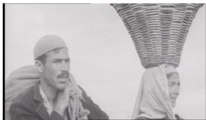
Figures 9 and 10. Captured Egyptian weapons and ammunition for Israel/ People as bystanders.

In the next example with pictures of the visit of the UNEF Commander, the Canadian Lt. General Burns, 47 in Port Said, typical patterns of important people's arrival and departure are recognizable. A standard sequence of pictures is employed: impressions of an incoming plane followed by the Commander stepping onto the Gangway, shaking hands with representatives, cut to an opened car door, and the departing car, with the camera following the car. The corresponding news-text provides information about the Commander having arrived to inspect the troops during the clean-up process. In a second part of the report, troops are also shown during their leisure time (see Figure 11). These images do not display abstract political processes, but they offer the audience easy-to-understand content, which they could easily relate to from their TV-screens at home. Additionally, the images stressed the UN efforts in the crisis. The voice-over 48 however, provides background information about Lt. General Burns' difficult situation, as Egypt demanded