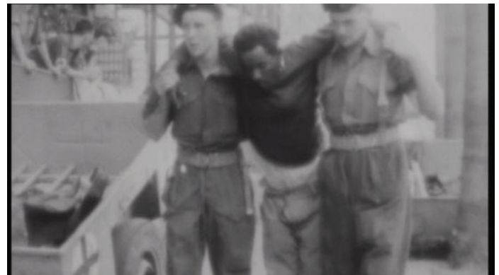
Figures 6 and 7: Shooting at a crisis hotspot.

Images of a refugee camp reveal not misery, but daily life by showing close-ups of women and children in a UNRWA-refugee camp (United Nations Relief and Work Agency) near the Gaza strip. The newsreader's text provides pieces of background information about the people on display: Arabs, who have fled from Palestine – people isolated between frontiers who have lived in this camp for eight years. For the German audience, the exotic traditional clothes people were wearing, as well as the impressions of daily life in a UNRWA Camp, proved to be highly interesting. 45 And again, since the cameramen filmed right from the centre of events, standing in the middle of a congregation of people (see Figure 8), the images gave the audience the impression of being there – almost participating in the events presented to them.