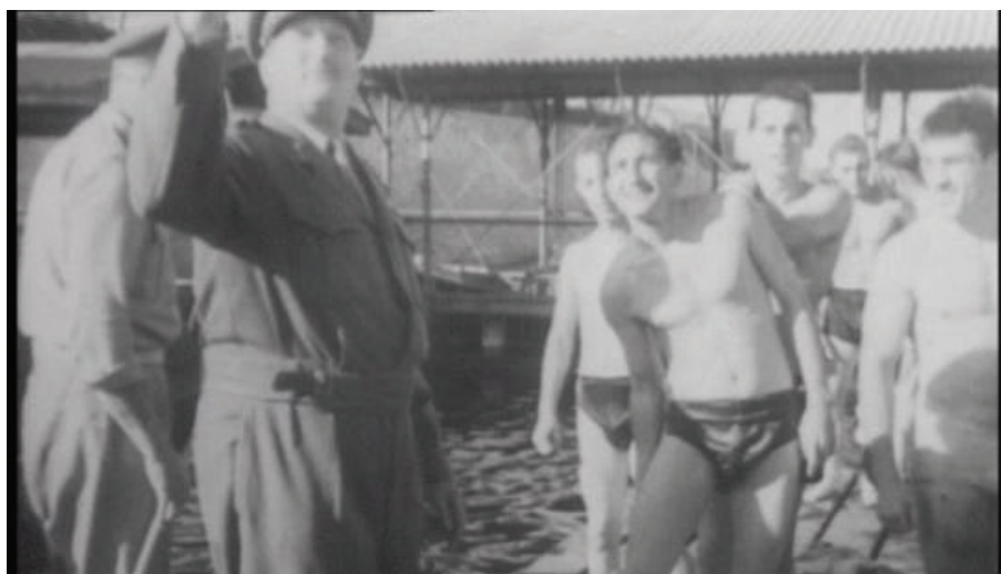
Figure 11. UNEF Commander in Egypt.

the withdrawal of Britain, France and Israel and threatened to involve voluntary armies deployed by the Soviet Union and China. These images show easy daily life, whereas the text reveals the difficulties inherent in the overall situation of the Suez Crisis.