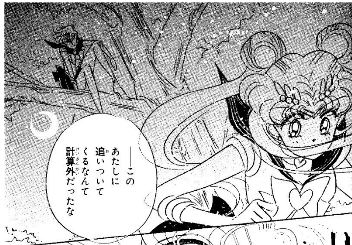
Fig. 4: Sailor Uranus calls herself » atashi « (TAKEUCHI 1994/2: 61)