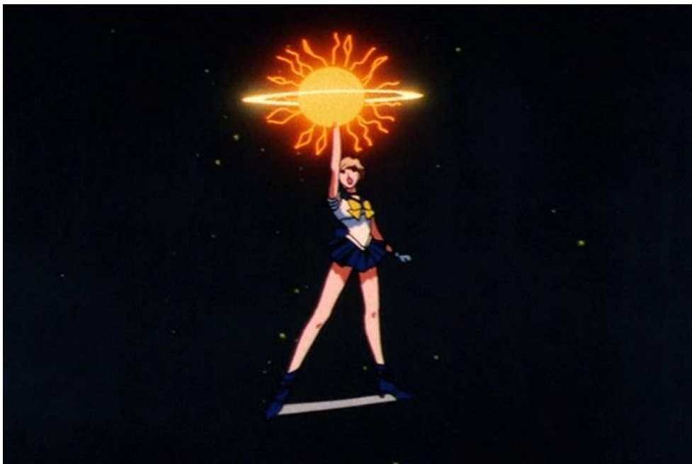
Fig. 2: Sailor Uranus in a battle scene of Sailor Moon S (episode 92, 1994)

The protagonist Usagi, also known as Sailor Moon, and her friend Minako, also known as Sailor Venus, are playing a racing game at a game center in the series' 92 nd episode. When they start bickering, a person unknown to them (Haruka) approaches them, saying: »Hi girls, may I drive with you?« (translation M.I.). Her voice is lower and huskier than Usagi's and Minako's, her hair is short, and she is dressed in the male uniform of a Japanese high school student: she is wearing trousers and a tie. Therefore, at her first appearance, Haruka looks decidedly like a high school boy . Moreover, Haruka refers to herself as » boku «. In Japanese, » boku « is a first-person pronoun for male speakers. Taken together, the vocal database reinforces the visual database to present Haruka as a young boy. Not surprisingly, Usagi and Minako fall in love at first sight with Haruka (cf. fig. 1).