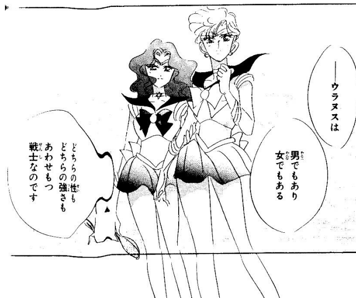
Fig. 5: Sailor Uranus reveals his/her sexual identity to be androgynous (TAKEUCHI 1994/3: 20)

Manga and anime are different media. In manga, there is no possibility for a direct vocal expression, so the presentation of Haruka is inevitably different to her anime counterpart. However, if the anime version had been more loyal to the original—which defines its gender by corresponding first-person pronouns and costumes—the anime-Haruka would have spoken differently: when Sailor Uranus said » atashi «, the voice would have betrayed a higher pitch, it could have sounded much more feminine. In comparison with the androgynous manga-Haruka, her anime version crosses the gender boundary and stands out significantly, since the identification of Haruka’s gender is not an important issue in the anime version. While Haruka’s gender identity is the subject of six episodes in the manga, the same issue is resolved within a single anime-episode. But while Haruka’s gender is only a minor explicit topic within the anime narrative, these questions are presented as much more complicated in formal terms. In the episodes that follow, she stays in male attire and speaks in a much lower-pitched voice (even in comparison to the only male protagonist, Mamoru), although she is definitively presented as female. For this reason, we can say that she deviates from stereotypical female characters to a large degree.