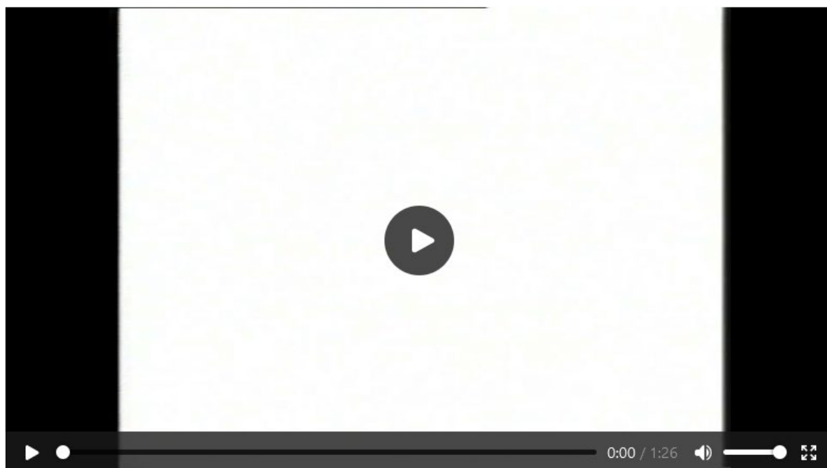
DIFFERENT VOICES PART 5 , Dietmar Schwärzler, AT 1998

In a 1998 video shot in his kitchen with no budget, Dietmar Schwärzler (who now runs the Vienna-based experimental film distributor sixpackfilm) offers an intersectional perspective on what this “more” might be. DIFFERENT VOICES PART 5 (AT 1998) is an adaptation of the trailer for Kathryn Bigelow’s STRANGE DAYS (US 1995). Beginning with the question “Are you sexual?” Schwärzler gives a comprehensive list of possible permutations of sexuality—of different modes of relationship. The affective component is striking: Today, Schwärzler sees himself in this video as the “angry young man of the 1990s,” enraged at inequality. He says that his aim was to make a video promoting a cause to a wider public—“like what you’d nowadays put on YouTube or Instagram.” 33