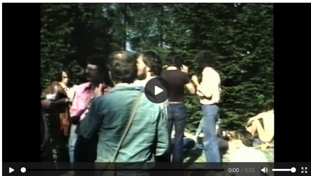
PFINGSTTREFFEN, AT 1977

casually presents us with structural racisms involving exoticized ideas of Arab masculinity (“cheap, submissively laughing Berbers”):