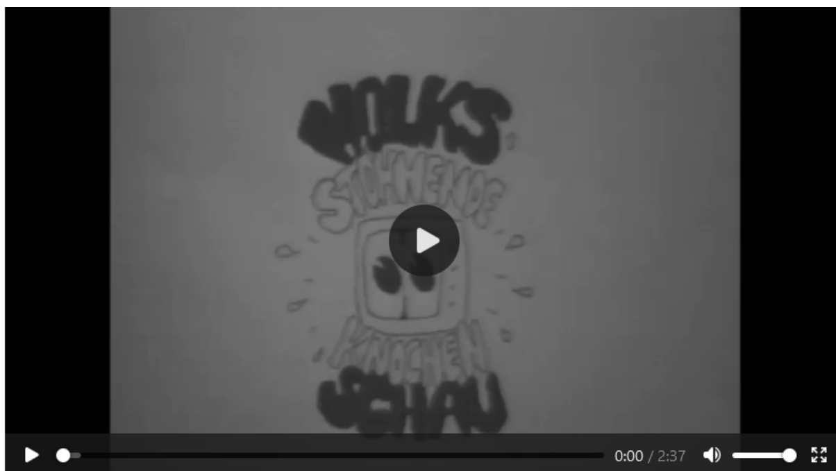
SCHWULSEIN KANN SCHÖN SEIN, HOSI Collective, AT 1980

Vienna, May 1980. One day before the presidential election, members of the Vienna Homosexual Initiative (HOSI, founded 1979) asked passersby on the street if they would vote for their preferred candidate if he were gay. It was part of Austria’s first participatory media project (“Volks stöhnende Knochenschau”), whose declared ambition was to establish a “counter-public.” The resulting videos were displayed on the side of a van, which could be driven around and allowed the videos to reach a wider audience on the city’s roads, streets, and public squares. The project took place in the context of an audiovisual media landscape where two government-owned television stations got to set the agenda, with no space for marginal groups. 36 Passersby responded that they would not vote for a gay candidate, and the interviewers were subjected to homophobia and hate speech. In the next sequence, we see members of HOSI setting up a temporary information stand at Wiener Festwochen alternativ (a radical alternative to the regular Wiener Festwochen , Vienna’s world-famous art festival).