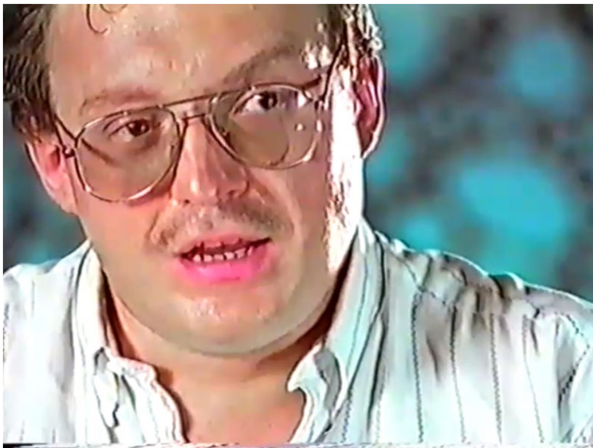
GIB AIDS KEINE CHANCE, DoRo Productions, AT 1994-1996