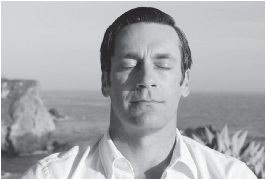
Fig. 4. MAD MEN . Waterloo S07E07. Don's Vision at Dawn

With his eyes closed, Don looks forward into a future, which, in the shape of an actual commercial from the year 1971, at once draws us back into the force field of the past. Owing to his memory work, the double time that keeps resurfacing in MAD MEN is carried through to the end. With this iconic commercial, real history enters into the past of a fictional world that Matthew Weiner historically re-imagined from the position of his own present, even as it leads us back into our contemporary moment. Young men and women from all over the world stand on a hilltop and, with their song, proclaim a collective desire for a global sentimental bond, achievable at a future moment in time. The fact that everyone is holding a Coca-Cola bottle in their hand further serves as the corporeal testimony of this wish for shared community: »I'd like to buy the world a home and furnish it with love.« Deployed as metafictional closure, this commercial offers its own comment