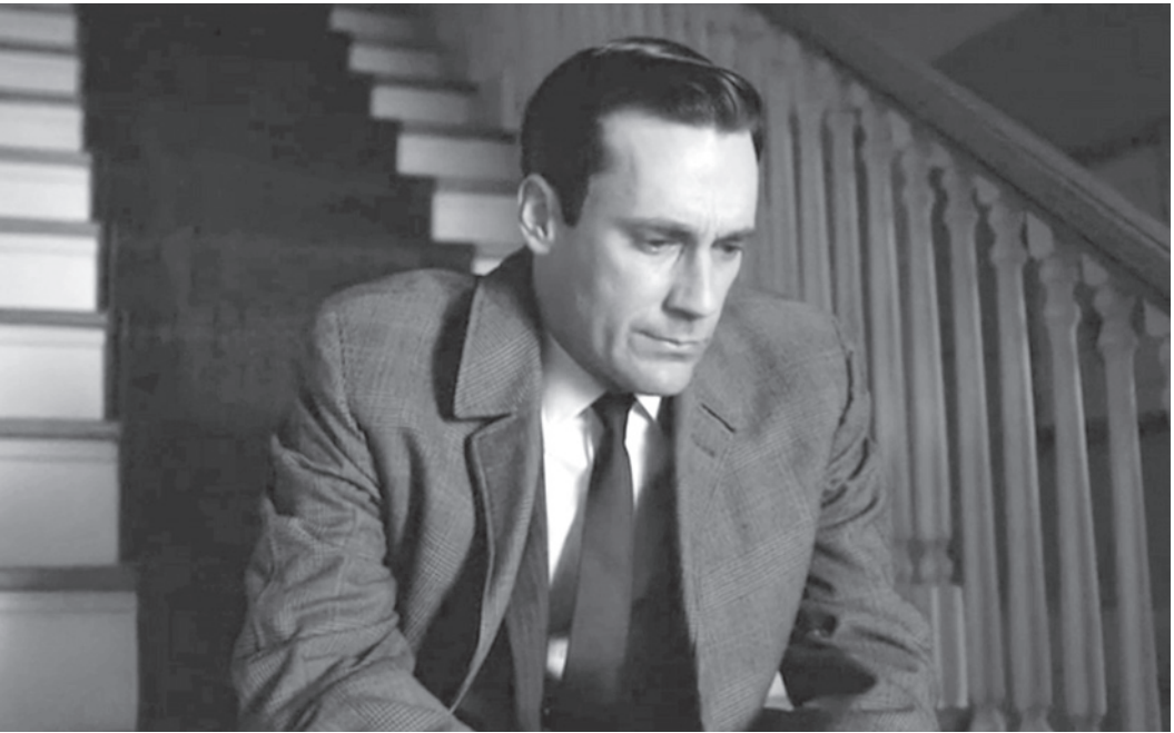
Fig. 1: MAD MEN. The Wheel SoI E13. Don Alone at Home

the stairs, and a frontal shot of his seated figure, staring out forlornly into space. In contrast to the daydream on the train, the pensive thoughts now occupying him are not ones Wiener seeks to share with his audience. And while sentimental music had underscored his fantasy of family reconciliation in the first half of the sequence, the sober reality of his solitude is now accompanied by silence. Only once the camera begins to pan away from him, sitting alone on the bottom of the stairs, thus leaving Don visually behind, do we begin to hear Bob Dylan on the soundtrack singing »Don't think twice, it's alright.« His song, invoking as it does a lonely dawn, serves as a comment on the reality of our hero's solitude. As the camera moves back further, Don visually fades into the empty spaces of his home before the screen goes completely black. This second ending draws its affective power from the way it is so markedly different from the alternative temporal moment of the daydream. If the second part of the closing sequence proves the impossibility of the first, this can also be read as Matthew Weiner's comment on the way his TV series is itself a time machine. Tapping into nostalgia even while debunking it as a sentimental journey reveals the latter as an impossible historical dream.