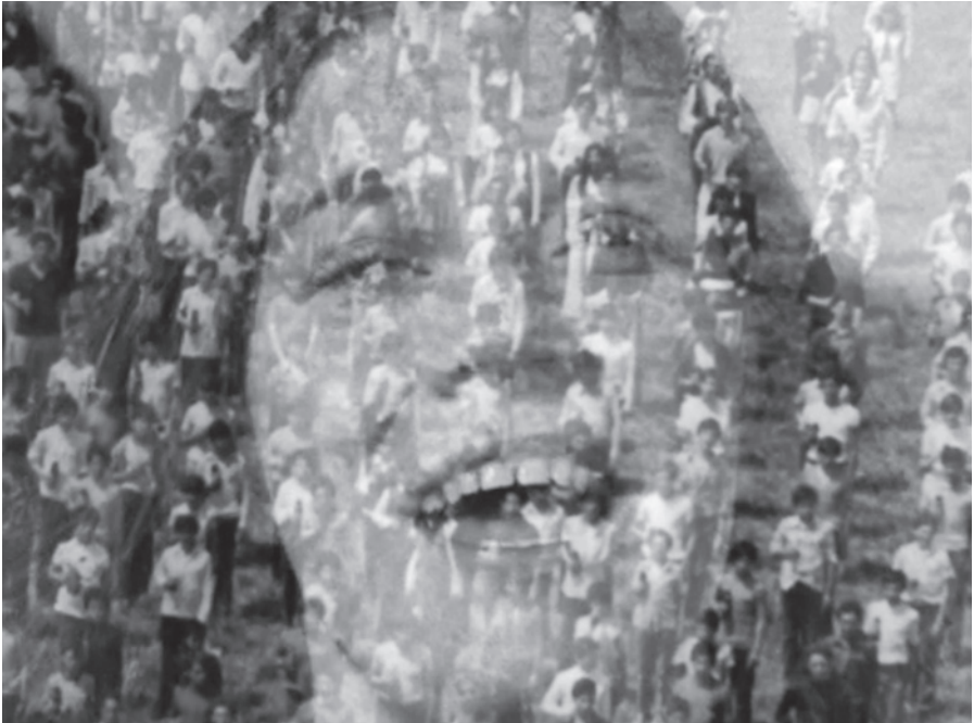
Fig. 5. MAD MEN. Waterloo S07E07. A Late Capitalist Version of the Body Politic

chorus are in turn blended together into a multi-layered composite image. At the end of the hilltop commercial, once the camera has moved into a long shot, the close-up of an enraptured young woman is shown, superimposed over the crowd, to unite all the separate figures into one collective body. We might read this as a late capitalist version of the body politic. We have not only left behind the realm of fiction, but the advertisement image itself has also been depleted of all referentiality. The scene it puts on display—in order to encapsulate the affective intensities of this historical moment of cultural transition, which is to say the transformation of counterculture into the language of consumer capitalism—taps into the singularity of this past even while transcending its specificity. Matthew Weiner's creation, MAD MEN , and the world his time traveling has evoked for us on screen each in turn dissolve into this temporal loop.