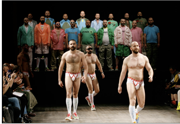
Figure 3 The finale of S/S Wonder, Paris, 2010

social media, not only by the members of the gay bear community but by anyone interested in fashion. Asked during an interview about the casting for Wonder show, Van Beirendonck answered that: “For the Wonderbear show in Paris, I casted through social media and online, directly in the bear community, which meanwhile became a huge community” 19 .