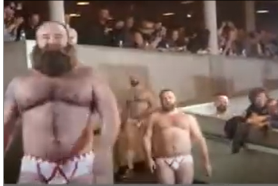
Figure 6 The Finale of S/S Wonder, San Francisco, 2009

As seen in fig. 6, the garments are modelled by people belonging to this subculture, in the city that created it. From the total of 39 models, most of them are polar bears and chubby bears, a far cry from the men of ideal bearish beauty from the Paris show. The models do not resemble the look of mainstream fashion models. They have chubby bodies and unedited beards that were not altered by hairstylists or makeup artists. This suggests the possibility that the San Francisco bear subculture still functions as a community that passes its values from generation to generation, while the Paris cast is comprised of superbears that create a different type of social bond, mediated by their interactions on social media.