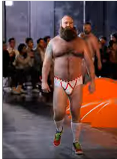
Figure 4 Bear model with long beard S/S Wonder, San Francisco, 2009

The San Francisco show is modelled by members of the local bear community and includes a higher number of chubby and polar bears (as seen in fig. 4 and fig. 5). On his official website, Walter Van Beirendonck names and thanks to each one of the models, a unique gesture that implies that his relationship with the models was personal. Looking at the video recordings of the San Francisco show, one can notice the joy and excitement of the models, as well as of the audience. At the finale, the crowd claps and cheers, and the gesture goes way beyond the appreciation of the clothes. It is the joy of the city that gave birth to all the embodiments of gay masculinities such as the clone, the leatherman, and the bear.