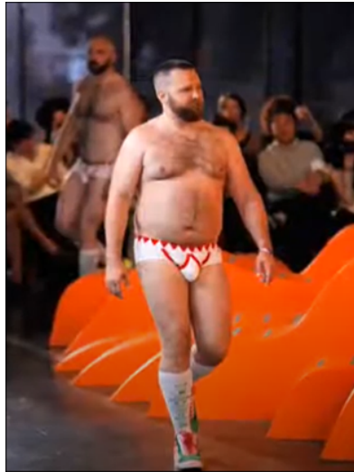
Figure 5 Bear model S/S Wonder, San Francisco, 2009