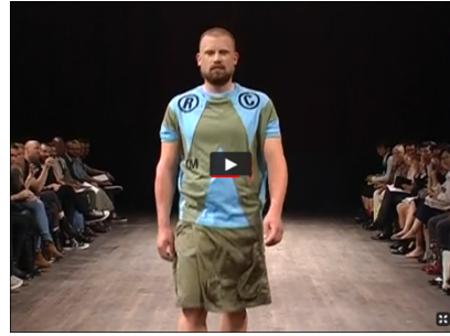
Figure 7 Model wearing a khaki skirt, S/S Wonder, Paris, 2009

From the perspective of Locke's method of identifying and analysing bear bodies, Wonder show from San Francisco features a larger number of chubby and polar bears. The cast of the underwear models closing the Paris Wonder show is formed of white, muscular, fit men, as opposed to a more inclusive finale in San Francisco that contains a larger number of chubby and polar bears. This choice suggests a shift in the representation of bear bodies. The superbear becomes preeminent as the body type favoured by social media. The runway shows reflect the development of the bear subculture which started in San Francisco as an underground movement fuelled by an ethic of care and ended as a mainstream global phenomenon.