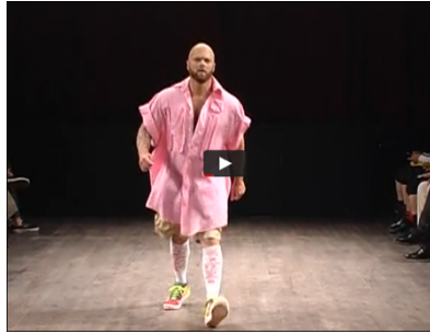
Figure 8 Model wearing a pink shirt dress with the text "Hi!", S/S Wonder, Paris, 2009