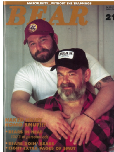
Figure 2 Figure 2 Cover of Bear Magazine No21, 1992

Initially confined to the West and East Coast, the bear community grew everywhere in the United States. During the 1990s, the movement found success in Europe, mainly in big towns. 6