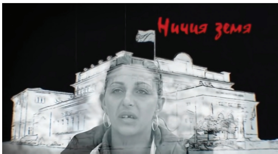
Video 1. Nichia Zemja , “The Third World Marries the Second One in Order to Reach the White One,” May 25, 2019.

One episode of NZ focuses on the already well-publicized story of a scam in which Roma women enter fake marriages with non-EU citizens. Under this scheme, the Roma women receive a payment while the men, who are primarily from Pakistan, Bangladesh, and India, obtain the privilege to travel and live in the EU. The title of the episode, “The Third World Marries the Second One in Order to Reach the White One,” embodies the racial anxieties which underpin the post-socialist condition. 34 The Second World, to which Bulgaria belongs, features as a midpoint between the white EU and the black “Third World.” In this worldview Bulgaria features as a peripheral entry point of the EU but it is not quite as white as Western Europe. Thus, this episode is reflective of the perennial feelings of inferiority and backwardness of Eastern Europeans, which throw into question their whiteness.