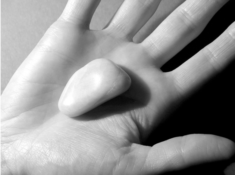
Figure 1: This quartzite stone was collected from the desk of a designer at my ethnographic site.