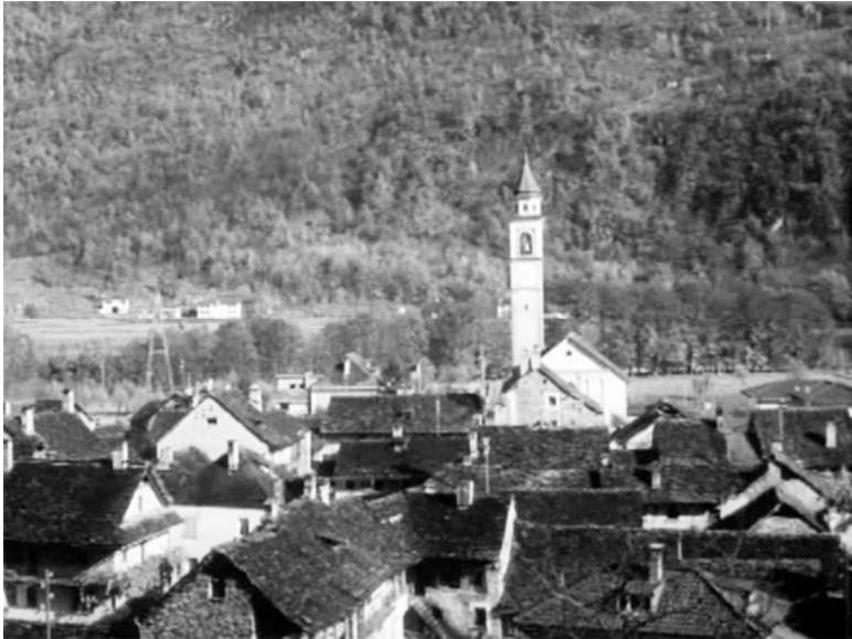
Fig. 1: “A typical Ticino village...”