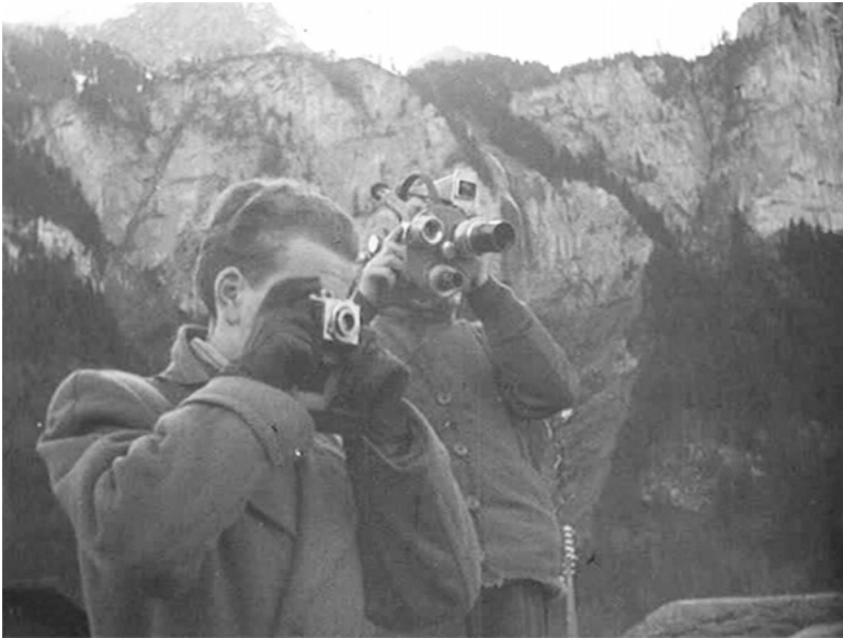
Fig. 6: Although “Swiss reporters are dragged off the landing field”, the newsreel feature manages to record and show the successful air rescue operation.