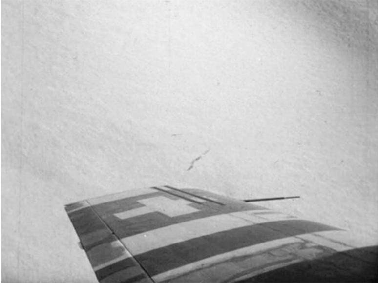
Fig. 5: “Tiny in the white wasteland” and filmed from a Swiss rescue plane, the SWN shows the rescue force approaching the crash site of the US-American military plane.