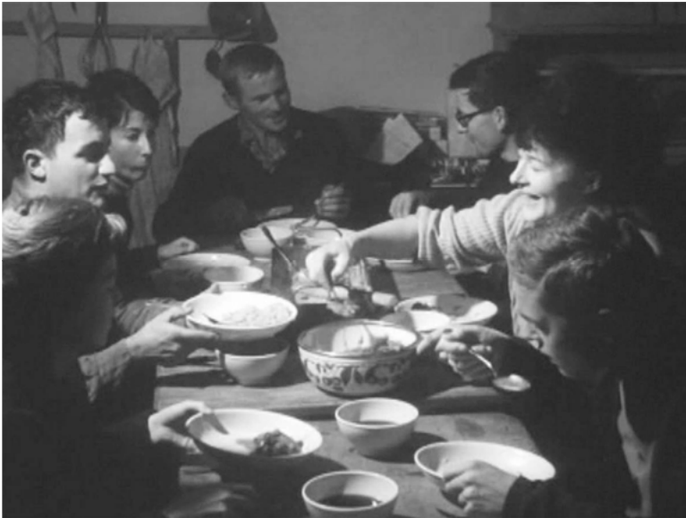
Fig. 2: ...with “similar simple conditions as at their future work destinations”.