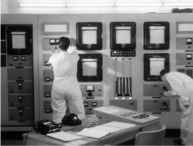
Fig. 3: The first experimental nuclear reactor in Switzerland is “carefully operated and monitored by exactly calibrated instruments from the control room ...”