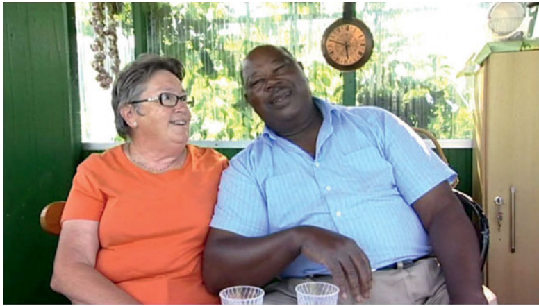
Fig. 7: Swiss-African couple