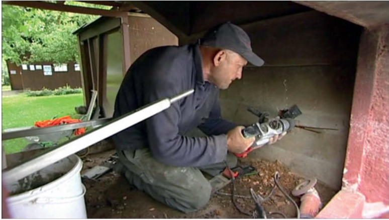
Fig. 5: The construction of a pork spit structures the narration.

Source: OUR GARDEN EDEN, Mano Khalil, CH 2010, Distributor: Look Now!, Zürich/CH