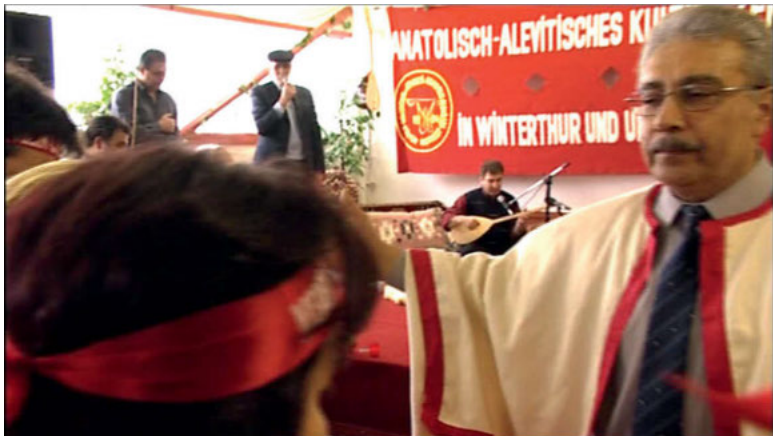
Fig. 4: The display of the Alevite ritual favors the Alevis, a separate Muslim community.