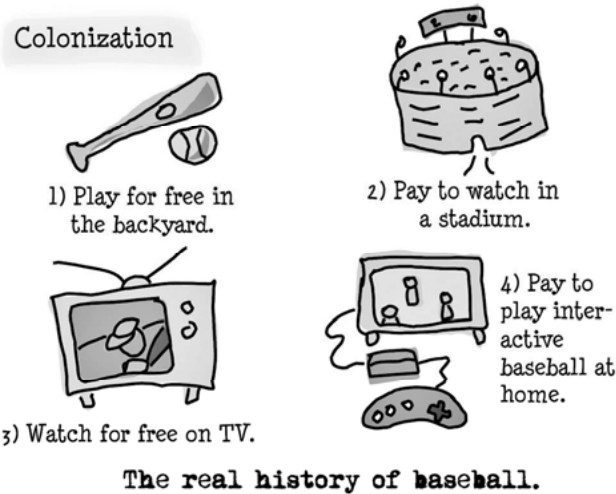
Figure 3: Colonization

Gold, Rich (2002): The Plenitude: Design and Engineering in the Era of Ubiquitous Computing , Cambridge: MIT Press, p. 117.