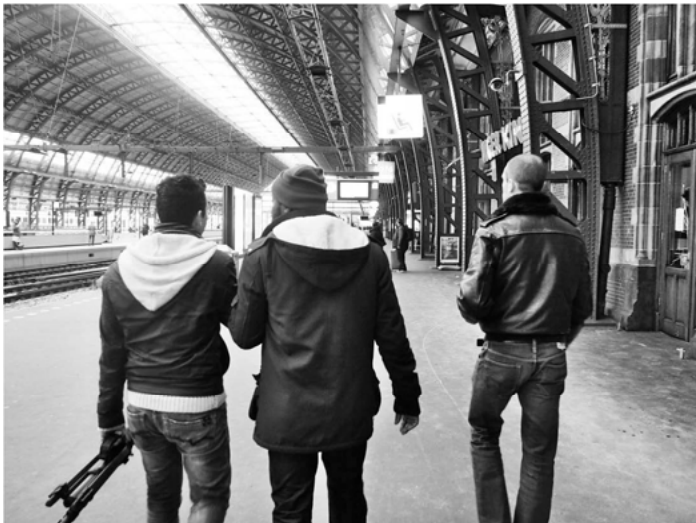
Figure 2: Workshop Mapping Invisibility

inant choreography and not adopting to the rhythms of capitalist society is of course not a radical choice, but the ultimate and inevitable consequence of not being recognized and acknowledged as a citizen and therefore as a co-producer of the city. In a way, the urban trajectories performed by the undocumented are as much a form of routine choreography as are those of the other citizens. Most of them, as becomes clear in the conversations during the walk, have developed a set of routes and routines that they repeatedly use depending on their personal needs and desires. For example, if they want to be able to sit down for a while without calling attention to themselves they go to Central Station and mingle with the people who are waiting for a train. Or, as already indicated in the introduction, if they need free Wi-Fi or take a nap, they can try to get into the public library and find themselves a reading booth. If they need God, they can go to a church. Their day ends by returning to their shelter. They wake up the next morning and continue with their daily routine. In this respect they are, to use a term by Certeau, 'blind walkers', strolling along predetermined paths without self-control and agency.