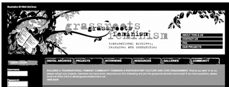
Image 1: A screenshot of Grassroots Feminism: Transnational archives, resources and communities

In a third step, a quantitative online survey was conducted to explore the habits of feminist media consumers in Europe. In total 230 persons participated in this survey from January 2009 until April 2012. Additionally, all collected data was continuously documented on the digital archive Grassroots Feminism: Transnational archives, resources and communities ( www.grassrootsfeminism.net ), which was set up in December 2008. The website hosts three digital archives – “Grassroots Media in Europe”, “Festivals: Ladyfest & Queer-Feminist” and “Zines” – and offers a chronological and geographical map of grassroots feminist media across Europe from the 1960s onwards, embracing digital and analogue media forms. By providing an interactive network portal and research platform for researchers, activists and media producers, this Grassroots Feminism Web 2.0 archive makes contemporary feminist, queer and antiracist cultural practices more accessible to researchers and the general public.