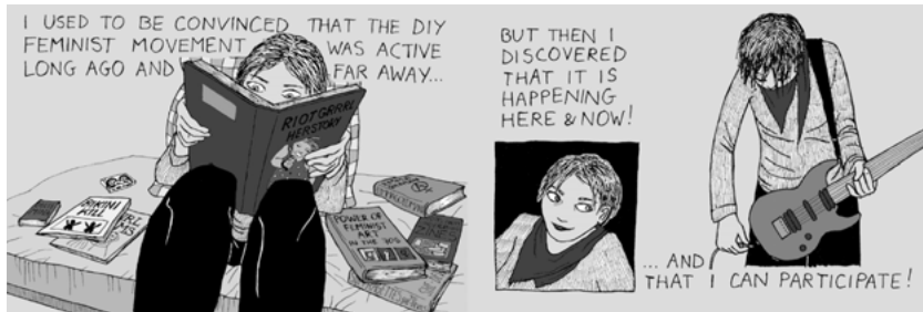
Figure 2. Remediating cultural memory to activate feminist participation. Slides from We Are Connected by Words and Wires