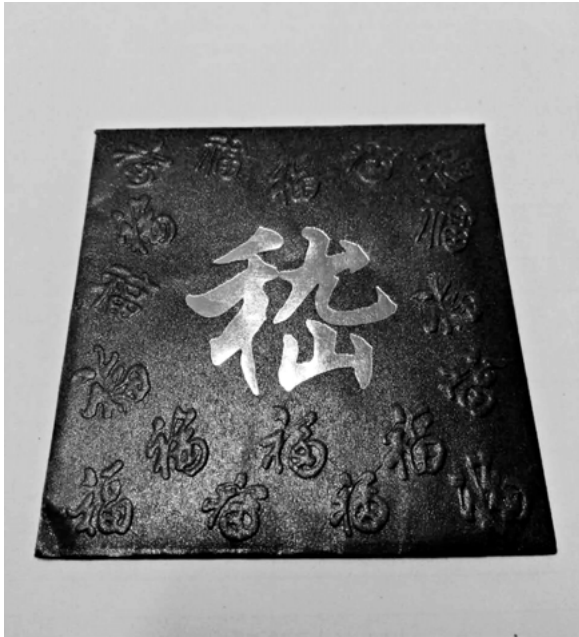
A red packet given to my nephews this year, bearing the word of my family name: Ji

When I was little, the most exciting thing about New Year was waiting for midnight on New Year’s Eve when my parents took out Red Packets to give to me—inside was brand new money. However, before they gave them to me, I had to say “gong xi fa cai, hong bao na lai”, which means: “I wish you a good fortune,