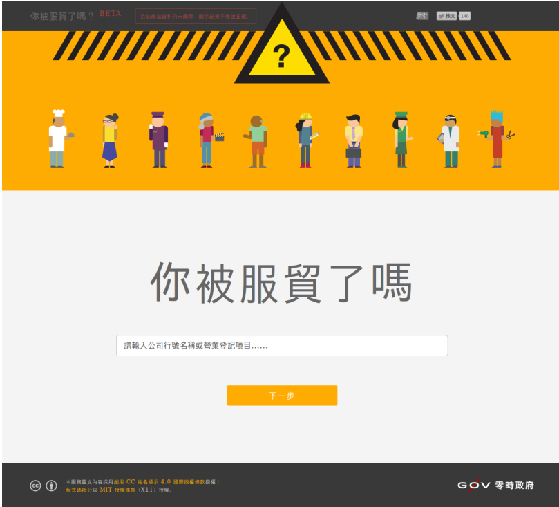
[Image 5] How will your company be affected by CSSTA tells visitors what the trade agreement means to them. Credit: http://tisa.g0v.tw/ .

and police actions to disperse the crowd on March 24th became hot topics once the general public took note of the whole situation. The site makes it easy for visitors to browse topics they find interesting and offers opposing arguments without censorship.