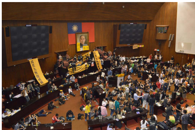
[Image 2] Students occupying the Legislative Yuan, Taiwan's parliament.

In the eyes of many students, CSSTA had been hastily signed between the respective governments of Taiwan and China without fully informing the Taiwanese public of what it entails. Taiwan's government asserted that the agreement would boost Taiwan's faltering economy, but students thought it would result in Taiwan becoming too dependent on China at the expense of Taiwan's relations with other allies, and thus become vulnerable to political pressure from Beijing.