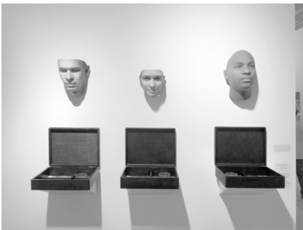
Image 4: Heather Dewey-Hagborg Stranger Visions , 3D face prints and sample boxes at Art Miami, 2014