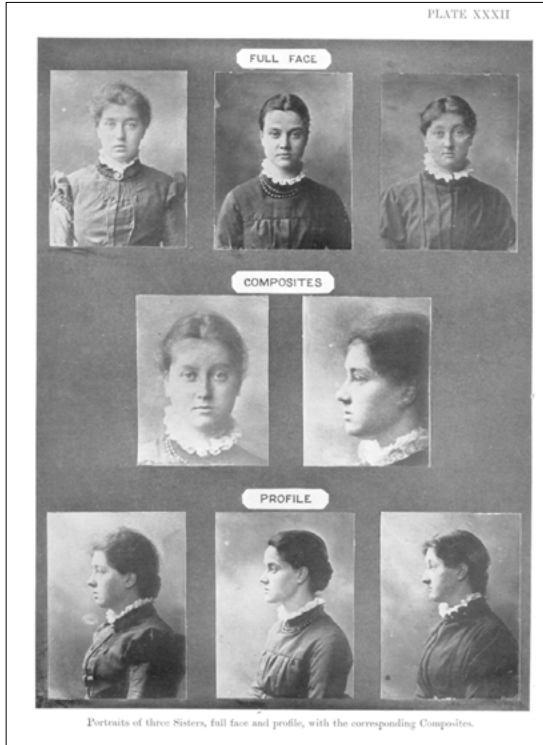
Image 3: Francis Galton, Composite photographs of three sisters, from the second half of the 19th century.