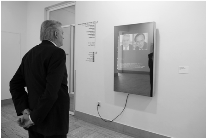
Image 1: Marnix de Nijs Physiognomic Scrutinizer/Mirror_Piece (2010).

The installation Physiognomic Scrutinizer was designed by the artist Marnix de Nijs in 2008 and further developed under the name Mirror_Piece in 2010. It is an interactive installation that uses biometric video analysis software to identify who the viewer most closely resembles, out of a database of 250 notorious personalities. When I experienced the work at the transmediale festival for new media art in Berlin in 2011, I was told by the interface that I looked like the famous early developer of computer science, Alan Turing (1912-1954), who was persecuted because of his homosexuality. The work plays satirically on the historical science of physiognomy, where the face is seen as a sign system (i. e. with a connection between a special type of nose and personal character). The comparison with infamous personalities establishes references to Cesare Lombroso's physiognomical criminal anthropology of the 1800s and Otto Weiniger's misogynist and anti-Semitic theory of human morphology in the book Sex and Character from 1903. In this light, it is no wonder that physiognomy has been largely eradicated. In 1999, the art historian James Elkins described how physiognomy as a science had entirely vanished (Elkins 1999: 73). But Physiognomic Scrutinizer raises the question of whether physiognomy, or at least the practice of reading the face as a structure, is somehow returning with face recognition technologies.