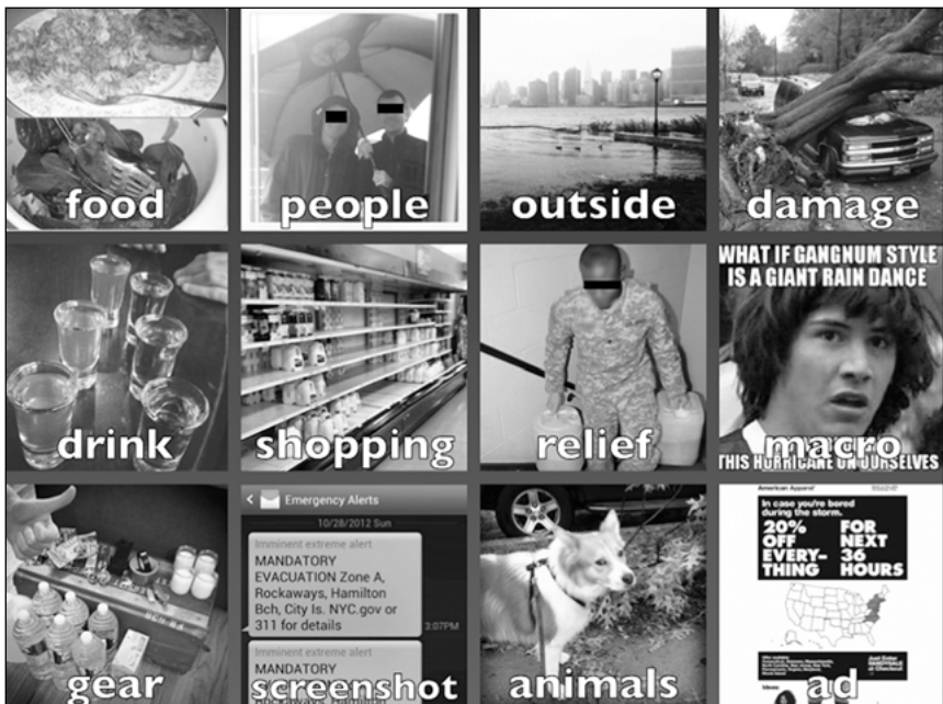
Figure 1: Examples of Instagram images by category.

Our data clearly illustrates that storm-related Instagram images are concentrated over a three-day period (see Figure 2). On the day of the storm, an increase in activity on Twitter occurred as users weighed in on the storm, including those far outside its path. This fits with previous work on Twitter and disasters which indicates Twitter frequency is generally highest the day a disaster hits (Hughes/Palen 2009). Unsurprisingly, the modal frequency of tweets was immediately after the US landfall of Hurricane Sandy (see Figure 2). Users at the peak of the storm, which occurred when Sandy made US landfall, were likely to post photos at a higher rate. On October 28, 2012, Instagram users posted photos regarding supplies for when the hurricane hit, ‘Sandy parties’ in restaurants and homes, and of friends and family. Sandy parties were common subjects of Instagram images. They featured groups of people eating and drinking before they had to face the predicted impact of Sandy. In terms of supplies to prepare for the storm (what we categorized as ‘gear’), it was clear that users felt anxious about how long the storm would be impacting the Eastern Seaboard. Many images were posted of storm rations, food, and forms of entertainment to keep people busy as they stayed indoors.