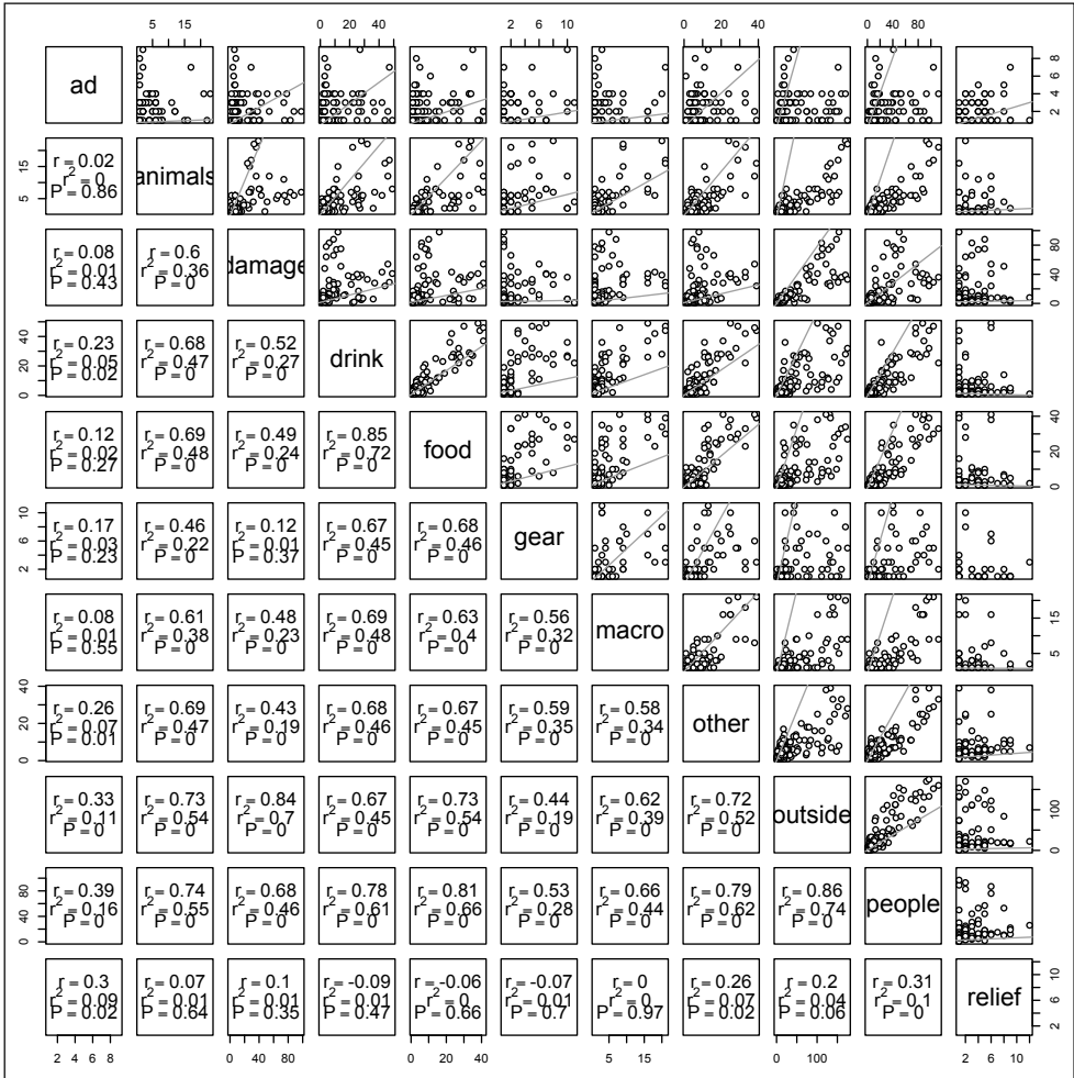
Figure 3: Correlations of all coded categories.

There are also several important instances of an absence of correlation. In particular, the lack of correlation between relief and macro is noteworthy as it signals a sort of taboo or no-go area regarding the Sandy relief efforts (especially the telethon). What emerges is an underlying understanding that relief efforts were a serious endeavour and key to larger, long-term post-Sandy recovery. The lack of correlation of relief with food and drink was expected as Sandy parties generally took place before US landfall. Every other category except for ‘ad’ has a significant level of correlation with macro, indicating that humour is widespread across Sandy-related motif categories, but not in the case of relief-oriented images. This is an important finding.