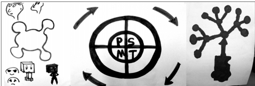
Figure 3: A selection of designs developed by workshop participants

With six female and four male participants, the workshop had a near-even gender balance, something that Marshall has experienced as difficult to achieve in technology-focused workshops (Briscoe/Mulligan 2014). Participants ranged from experienced software users to those with no technical experience. Everyone managed to create his or her own design and translate this into a printing block and audio clip. Significantly, only a few participants (all male) produced technology or tool-related imagery – most participants created abstract, diagrammatic or human-centred images to express the values they associated with Litchee Lab and making (see Figure 3).