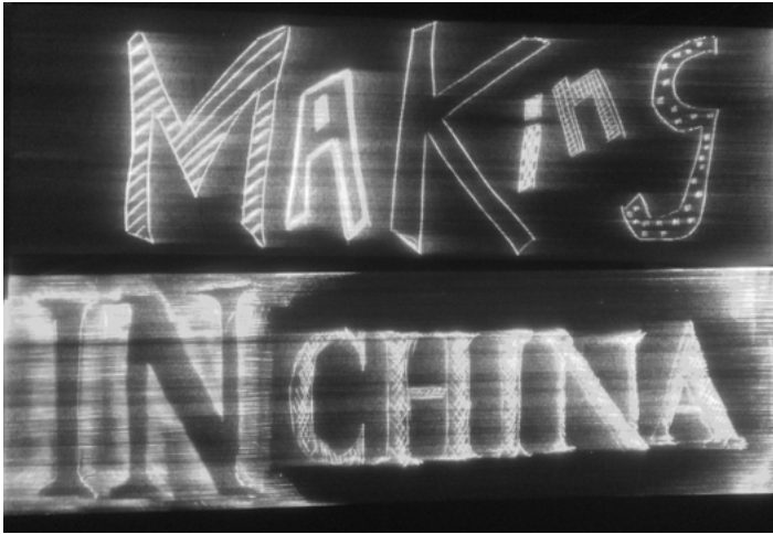
Figure 1: Distressed optical fibre “drawing”, outcome of “Digital Lace” workshop co-created by Marshall and Rossi

for their presence in, and contribution to, the UK's lively making communities: community, creativity, entrepreneurialism and sustainability . Stage three consisted of a five-day visit to Shenzhen and consisted of visits to makerspaces, design studios and other related making sites, making-based workshops and a public-facing salon. Stage four was a reciprocal trip by Li and Liao to visit makerspaces and related sites in London, Bristol, Manchester and Amsterdam and participate in a workshop and salon with the authors and other project participants.