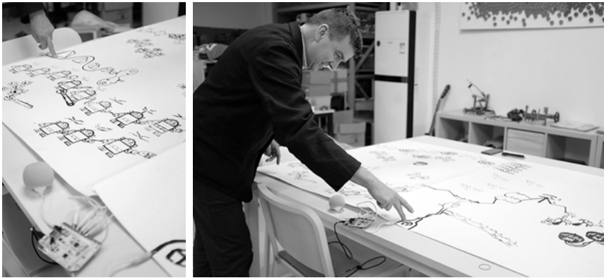
Figures 4 and 5: Final poster including the “touch board” and speaker that enables the audio files to be played

Simpson recognises the benefits of a dialogical, open-ended, “crafty” approach that perhaps can be contrasted with design workshops that aim for conclusive action and closure, rather than increased communication. As a sign of its success, Li and Simpson have repeated the workshop with a group of secondary school teachers, and it was again well received.