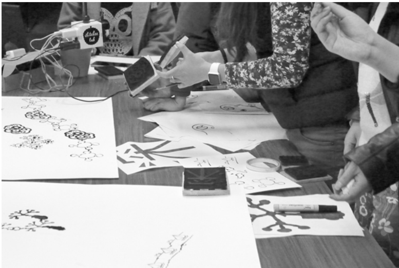
Figure 2: Laser-engraved printing blocks derived from participants’ drawn designs

The three-hour evening workshop took place at Litchee Lab, which prioritises affordable access to analogue and digital design and making facilities and space for Chinese and international makers to meet and education. It was co-designed and delivered by co-director James Simpson.