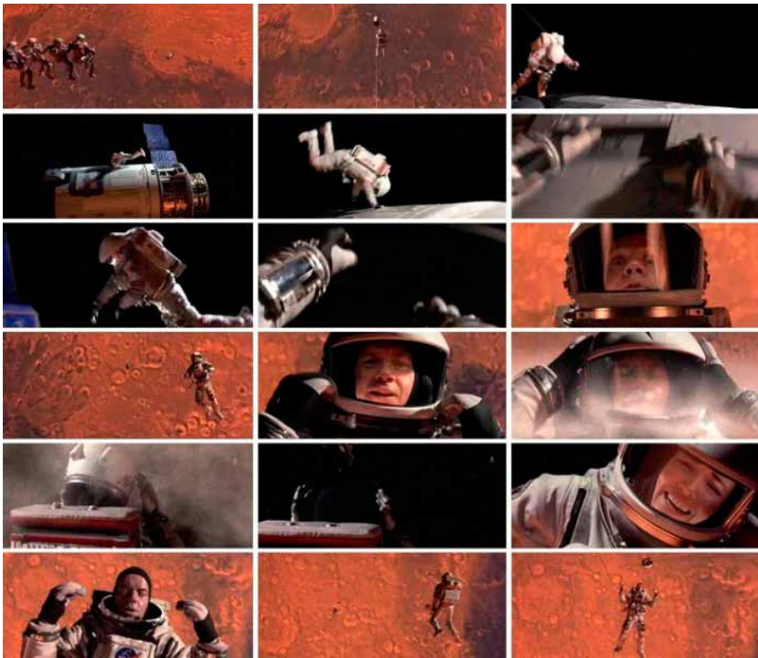
Fig. 1 Mission to Mars (Brian De Palma, 2000)

The formal style of representation combines a montage of shot sizes and points of view of various kinds, focusing on the character's capacity to accomplish his intentions: he cannot control his motion speed or the course of events. This limitation depends on environmental conditions (such as weightlessness and absence of gravity) that also affect the prehensive action of his hands, which are literally 'embodied' in dedicated spacesuit components – the gloves – and are unable to carry out their functions (in this case grasping). The gloved hands are agents of perception that act frantically because they are unable to make direct contact with the external world and the objects in the surrounding space. The hands fail to grasp because of the very medium that allows the astronaut to explore outer space.