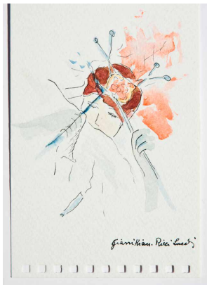
Fig. 5 Watercolour for Oh! Uomo

In a recent intervention, Gianikian stated that 'the soldiers who took part in the First World War died in two-frames time'. If this is true, then the 'analytical camera' shows the specific engagement of the authors with repressed contents, since what is often excluded by the representation choices becomes here the beating heart of their work. In other words, what nowadays does not respond to fictional and filmic economies is endowed by Gianikian and Ricci Lucchi with a new figurality and a new cinematic consistency. The spectator is presented the interstitial as a site of renewed tangibility of reality, even when it does show brutality and violence. An excerpt from Frammenti Elettrici shown on the central screen of the cube seems to interpret such a logic in a very radical way: a woman undergoes a terrifying surgical operation on her head, which is filmed step-by-step. The medical methods and the tools used by the doctors are old and inadequate, with the result of an inhuman, cruel scene developing for the viewer. The effect on the public is a reduction of motion in the room space, a catatonic gaze, and a mystical silence.