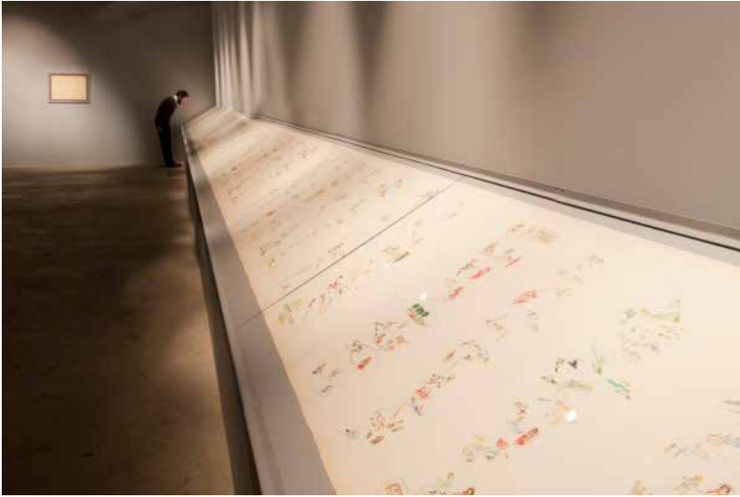
Fig. 2 Watercolours roll

hunts, weapons, wars, or religious processions, which have all been drawn. Therefore, the sections of the film come up again and again, producing a gigantic sea of images, in which it was actually easy for us to get lost. These illustrations and diagrams helped us in finding our way in this visual universe.