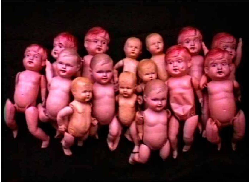
Fig. 6 Carrousel de Jeux (2005), single video, Hi8, 43', sound

Another kind of violence (apparently camouflaged as a collection of gentle, almost funny objects) is visually expressed by Carrousel de Jeux . This installation is set in the smaller room of the temporary pavilion, which opens and also somehow ends the exhibition. The spectator is presented a collection of old toys that are systematically approached by the hands of Gianikian, who studies them under the eye of the camera. Following such an exploration, we rapidly realise that the presumed ludicity dissolves in a deep sense of anguish.