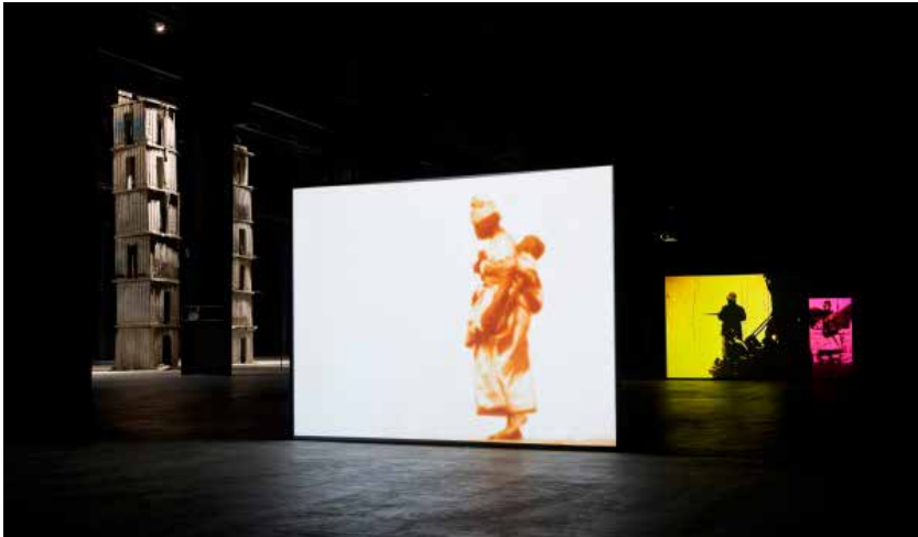
Fig. 3 La marcia dell'uomo (2001), three video projections, 35 mm, 4'30", sound, music Keith Ulrich

second screen displays an ethnographic piece released around 1910, dealing with the imposition of Western habits, social practices, and cultural conventions on African people; the third screen presents an excerpt taken from a home movie from the 1960s, where a white man poses between two topless African girls wearing traditional costumes, afterwards paying them for having taken part as ‘folkloristic presences’ in his portrait.