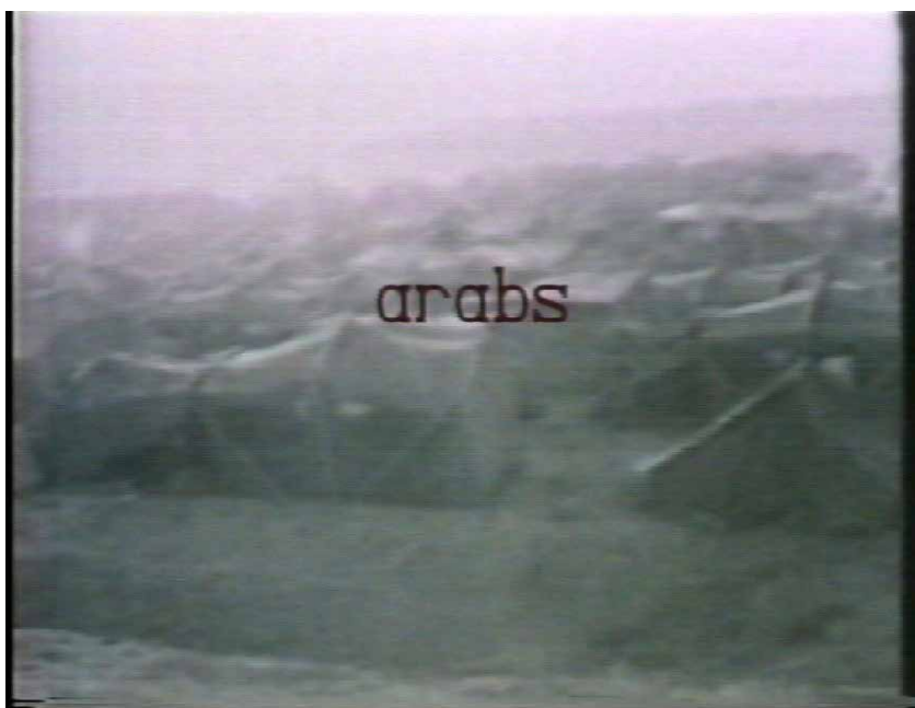
Fig. 2a, 2b, 2c, 2d: Introduction to the End of an Argument (Jayce Salloum and Elia Suleiman, 1990).