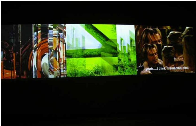
Fig. 1: Living Tomorrow (Linda Wallace, 2005).

fling of images and subtitles, murders take place, marriage proposals are made, and some are refused because the blond protagonist claims that ‘she wants to wear the headscarf’. Woven into the unfolding narratives – through which a distinctly Dutch cultural and geographic landscape emerge – is the highly publicised 2004 murder of the Dutch film producer Theo van Gogh. Although the juxtapositions and connections in Living Tomorrow strike the viewer as fictive and even humorous, as the piece progresses she is confronted with something more complex: the many social, cultural, and political threads of a society are shown to intersect in new ways.