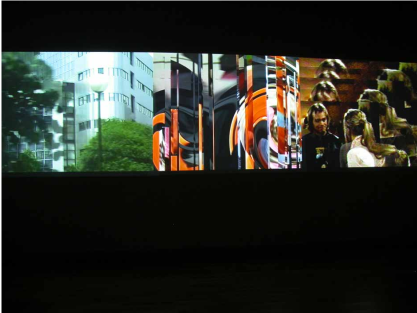
Fig. 4: Living Tomorrow.

In this work, representations are transformed into morphing surfaces that call to mind geometric patterns, textures, swirls, and folds.