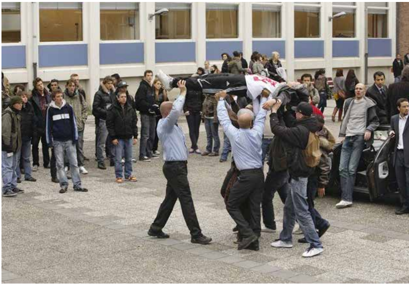
Fig. 3: Schoolyard (Aernout Mik, 2009).

recognisable archetypal media representations. For example, youths playing on and vandalising cars progressively evokes familiar suburban protests, while processions, in which an individual is hoisted up and transported by the crowd, evokes stock images of funeral processions in the Middle East. Through a subtle and gradual alteration in facial expressions and bodily movements, the procession turns into the suggestion of a football player being paraded around after having scored the winning goal. The piece is filled with morphing transitions between camaraderie and rivalry, pleasure and violence, of individuals being a part of, or disconnected from, the group's composition. On a basic level, Schoolyard raises questions regarding the emotional charge invested in media images, and how such images are internalised and acted out in everyday social situations.