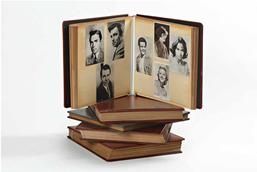
Fig. 4: Michelangelo Antonioni's Film star postcard collection. Ferrara, Gallerie d'Arte Moderna e Contemporanea, Museo Michelangelo Antonioni.

The curators have placed great attention in highlighting Antonioni's peculiar activity as a collector of both art objects and of mass culture items. This emerges in particular from the personal letters displayed in the exhibition's showcases. For instance, Antonioni's correspondence with the sculptor Arnaldo Pomodoro deals with the director's intention to meet artist Mark Rothko for the purpose of acquiring some of his works. Apart from collecting paintings of celebrated 20 th century artists, Antonioni also collected film star paraphernalia, particularly film postcards from the 1910s well into the 1970s. This personal collection is exhibited mainly through a large video installation that takes up the entire wall of the first hall, showing two hands browsing through the many leather bound albums where Antonioni arranged the postcards. Antonioni's activity as a collector of both paintings and film star postcards should not be dismissed as a curiosity, but rather should be considered as revelatory of an approach towards images that overlooks current distinctions between high and low culture; it should be related to Antonioni's ambiguous attitude towards the products of modernity. 8