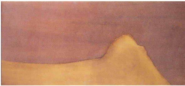
Fig. 1: Le montagne incantate nr. 153, no date, mixed technique. Ferrara, Gallerie d'Arte Moderna e Contemporanea, Museo Michelangelo Antonioni.

materials that are being shown in the exhibition, along with several clips from Antonioni's films and with paintings that bear different kind of relationships with the director's works. In fact, as the title suggests, the main focus of the exhibition is the continuous relationship between Antonioni and the visual arts, and in particular with painting. This choice is due mainly to two factors: first, the importance that the relationship between Antonioni and painting has always had in critical literature about the director; second, the fact that Antonioni was a painter himself. In fact, since the mid-1970s, Antonioni had started working on Le montagne incantate (i.e. The Enchanted Mountains ), a long series of visual works that would eventually be shown both in Venice and in Ferrara in the mid-1990s.