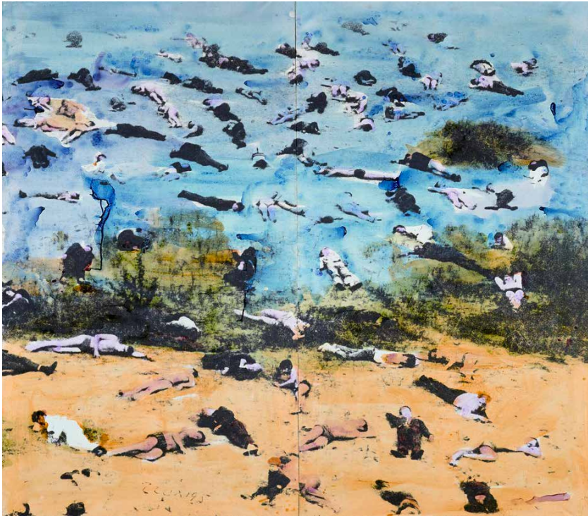
Fig. 3: Mario Schifano, Tutti morti , 1970, Nitro enamel on emulsified canvas. Private collection.

The selection of paintings has clearly been guided by a philological methodology, and has been conceived by the curators through an examination of Antonioni's own letters and diaries in addition to the critical literature about the director. This approach, combined with the exhibition's chronological structure, clearly highlights the curators' main goal of allowing even a non-specialised audience to become familiar with Antonioni's works. This is a task that is generally accomplished, even though the placement of the projectors in the Palazzo dei Diamanti's rooms, which are often small and narrow, sometimes has confusing results, particularly when different speakers collide. On the other hand, an audience already familiar with Antonioni's films may find that the painting selection is somewhat limited, as there are only about a dozen works shown, probably due to budget restraints and other limitations experienced by the curators. Moreover, the focus on the relationship between Antonioni and painting comes at the expense of other aspects of Antonioni's work, leaving out other interesting elements such as props and costumes, for example.