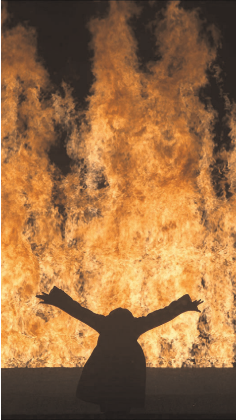
Fig. 3: Bill Viola, Fire Woman, 2005; color high-definition video projection; four channels of sound with subwoofer (4.1); screen size: 19 x 10 3/4 ft (5.8 x 3.26 m); room dimensions variable; n:12. Performer: Robin Bonaccorsi.

The installations feature a projection onto a tall, vertically-oriented screen, where the soul of the literary hero is awakened after his death and raised to the sky through a spectacular waterfall. Also, a second tall projection presented the vision of a woman standing up against a wall of fire and then falling into the water. After these two mythical and mystical apparitions the public at the Grand Palais was invited to step back into the more concrete and human body in the diptych Man Searching for Immortality/Woman Searching for Eternity (2013), where two naked figures of senior citizens are projected on large vertical slabs of black granite, as if they are carved out over their graves; their skin is explored with a small light, trying to isolate diseases or corruptions. The seven submerged bodies of The Dreamers suspended between life and death closed the exhibition and the public's spiritual journey.