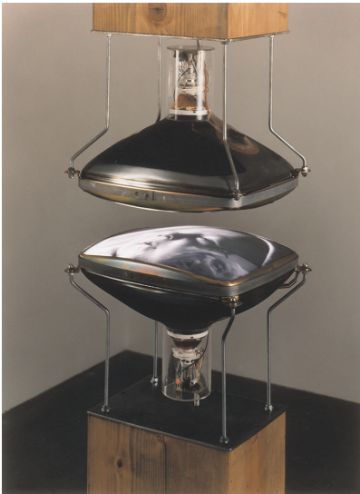
Fig. 2: Bill Viola, Heaven and Earth, 1992, video installation; in a small alcove, a wood column extends from the floor and ceiling with a gap in the center formed by two exposed monitors facing each other, two inches apart, mounted to upper and lower columns respectively, a black-and-white video image on each monitor; 9 1/2 x 16 1/8 x 18 ft (2.9 x 4.9 x 5.5 m); 29:52.