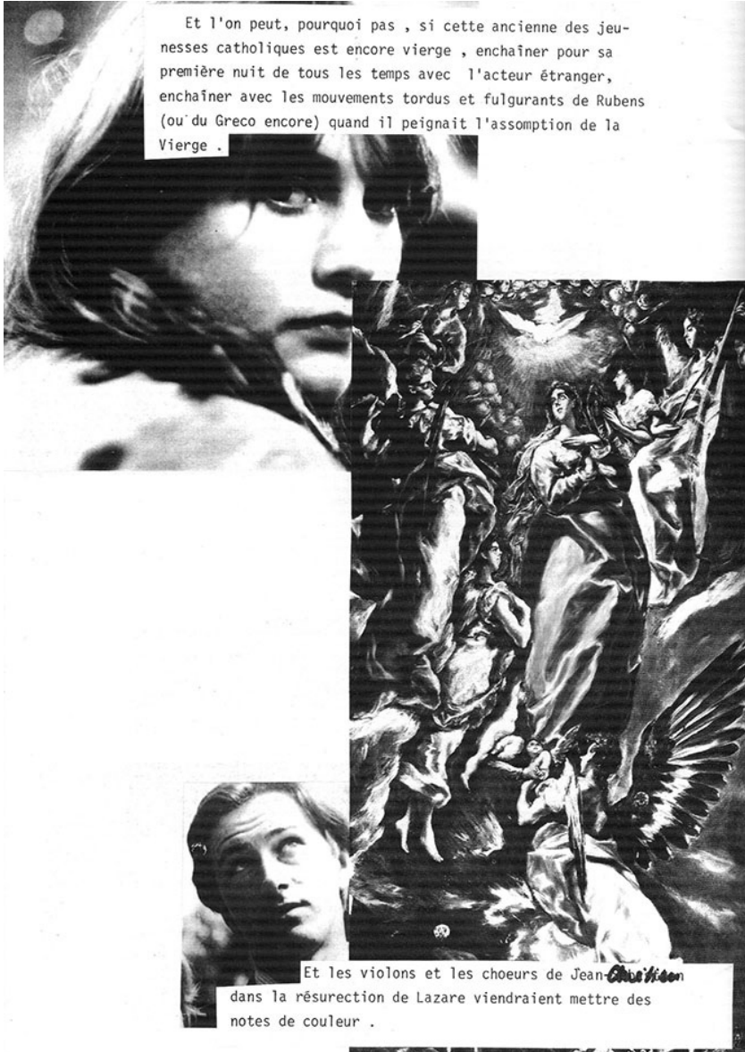
Figs 7a, b: Still from Man of Marble used to illustrate the roundtable discussion of the film in Cahiers du cinéma, No. 298 (March 1979), and Godard's re-use of the image in his treatment for Passion.