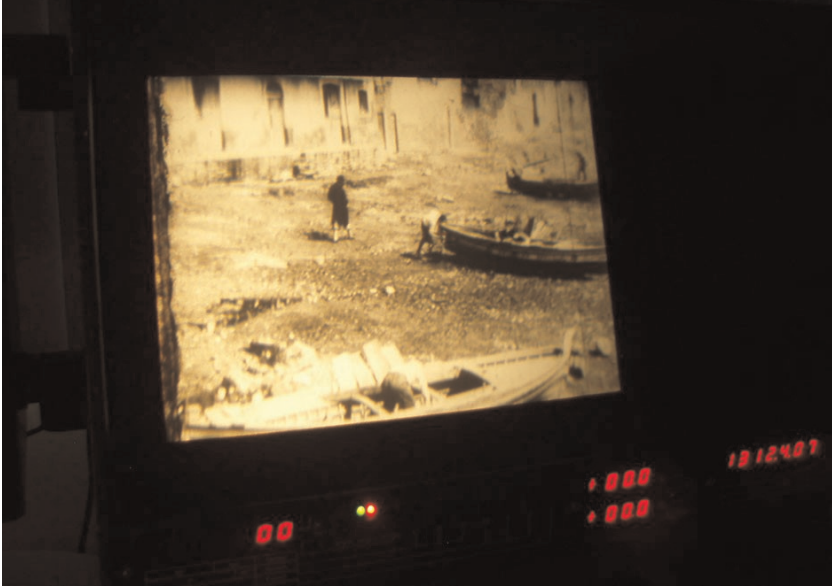
Fig. 5: The start of the third reel of The Earth Trembles on a Steenbeck in the EYE Film Institute Netherlands archive.

sketchbook for Passion as it was a critical reflection on Sauve qui peut (la vie) .