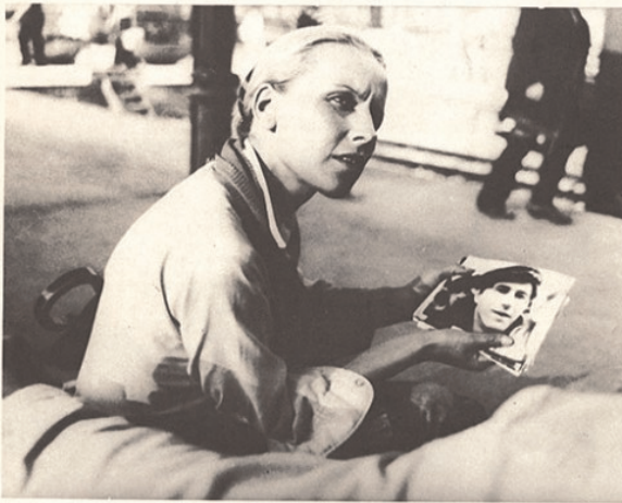
Figs 6a, b: Still from Man of Marble used to illustrate the roundtable discussion in Cahiers du cinéma No. 298 (March 1979); Godard's re-use of the same image in the special issue of Cahiers he edited two months later.