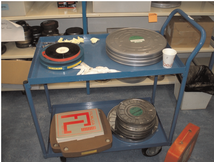
Fig. 2: The source films in the EYE Film Institute Netherlands archive in September 2013.

Although I was able to view copies in the EYE archive of all the films that Godard combined to make Sauve la vie (qui peut) it is difficult to know for certain whether they are all the actual prints he used. Only two of the archival prints I viewed – Old and New and Man of Marble – were 35 mm. The others ( Sauve qui peut (la vie) , Cops , and The Earth Trembles ), which are the only prints of these films in the archive, were all 16 mm. With the print of Old and New the situation is straightforward – the reel in question coincides directly with the sequence used in Sauve la vie (qui peut) . The case of Man of Marble is more complicated since in this instance the reels