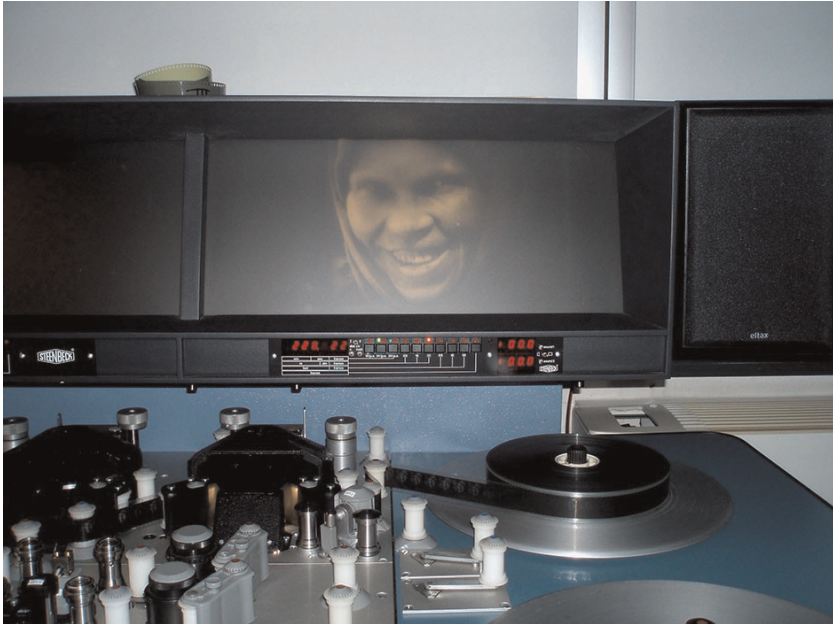
Fig. 3: The beginning of the third reel of Old and New on a Steenbeck in the EYE Film Institute Netherlands archive.

Toutes les histoire(s) and indeed before Sauve la vie (qui peut) . He was already evoking it (via its original title The General Line ) as an important reference in the video 'script' for the film Scénario de Sauve qui peut (la vie) , where Denise is characterised in terms of a quest to explore the unknown and to investigate what is happening 'behind the general line'. There are several reasons why this film might have appealed strongly to Godard during this period: it is Eisenstein's only film to tackle a contemporary subject; it has a highly experimental form; its themes of city and countryside, and of the interrelationship of love and work, chimed directly with Godard's concerns at the time. It also provides an eloquent lesson in how to film nature and animals in particular, and one senses strong echoes of Old and New in Sauve qui peut (la vie) , notably in the shots of cows and horses, in the brief sequence of a tractor ploughing a field, and in the scene (reused in Sauve la vie (qui peut) ) depicting Denise's visit to a milking parlour on a farm.