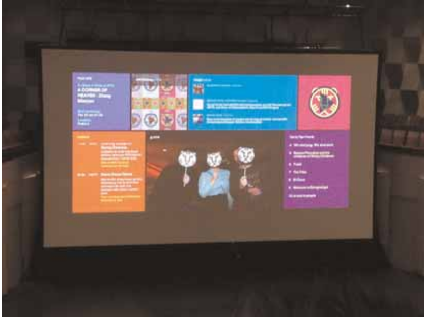
Fig. 1: IFFR's interactive screen.