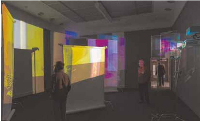
Fig. 3: 'Shunga' (2014).

here is a documentary filmmaker very much aware of the increasingly difficult status of the documentary as genre and practice, especially in the digital age, especially when poised between cinema and television on one side, and art space, museum or gallery on the other. 13