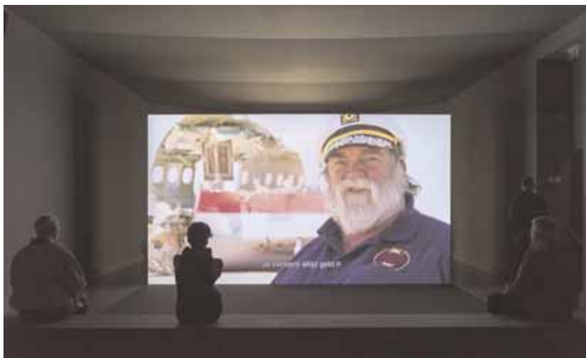
Fig. 5: 'In Free Fall' (2010).

These three experimental films show us that images have gone beyond depicting pre-existing conditions and in the process have acquired a temporal dimen-