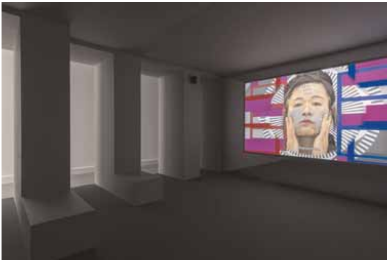
Fig. 1: 'How Not To Be Seen. A Fucking Didactic Educational .MOV File' (2013).