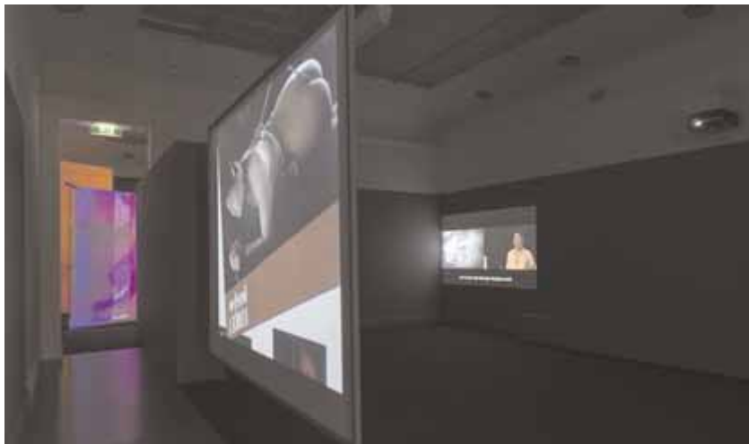
Fig. 4: 'Lovely Andrea' (2007).

becomes the prime matter for building the platform upon which the image of its death will be stored. As sizzling aluminium flows Steyerl concludes: 'matter lives on in different forms, this does not apply to humans', still reading from Tetryakov's book. More than rehabilitating a proto-object-oriented ontology, the filmmaker brings to our attention the literal shift from representation to modulation as materiality transubstantiates into image and back, eluding all physical boundaries.