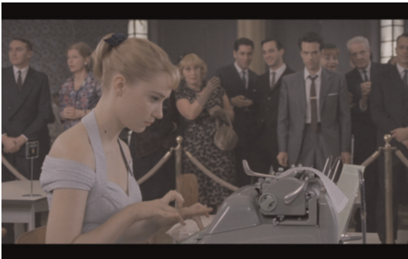
Fig. 2: Speed typing competition in Populaire .

Films belonging to this category are set in the past but their style does not try to be contemporary to the narrated story. Conversely, they often present a very glossy and striking perfection in the image without any sign of decay. 32 We think here of films such as Populaire (Régis Roinsard, 2012), American Hustle (David O. Russell, 2013) and The Great Gatsby (Baz Luhrmann, 2013), among the many period comedies and dramas set in the recent past. 33 In the former the retro style is best exemplified by ‘the aesthetic of display’, what Andrew Higson describes as a pivotal feature of heritage films. 34 Typing machines, 1970s disco fashion, and Art Deco design objects are ‘on display’, meticulously arranged to offer pleasure to the audience. These films not only dwell on the sonic and visual heritage of the time, creating a beautiful, clean, and highly fetishised depiction of a particular era, they also manage to include a series of links to and reminders of the different paratextual retro-trends and fads of the contemporary Western societies which they inform and are informed by. For example, the hit television show Mad Men (2007-2015) had a profound influence on the fashion industry, including special capsule collections created by costume designer Janie Bryant, which were released by Banana Republic.