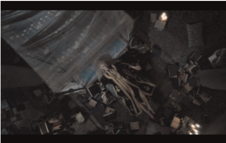
Figs 5a, b: The anachronistic objects of Adam and Eve.