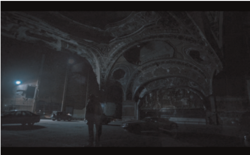
Fig. 4: Detroit's ruins in Only Lovers Left Alive.

The narrative strongly stresses the feeling of isolation and deterritorialisation in contemporary times. Eve, played by Tilda Swinton, lives in a timeless Tangier which seems the one of William Burrough's exile; she loves being surrounded by old books, exotic fabrics, and lingering with her mentor and friend Christopher Marlow, a vampire himself. Then there is Detroit, once the centre of American industrial production and now an abandoned and empty shell characterised by factories in ruins. Adam, played by Tom Hiddleston, lives in a vast flat surrounded by a deserted industrial area which seems stuck in time, with the electricity provided by a generator and no running water. His nightly car journeys reveal a wasteland of inhospitable peripheries.