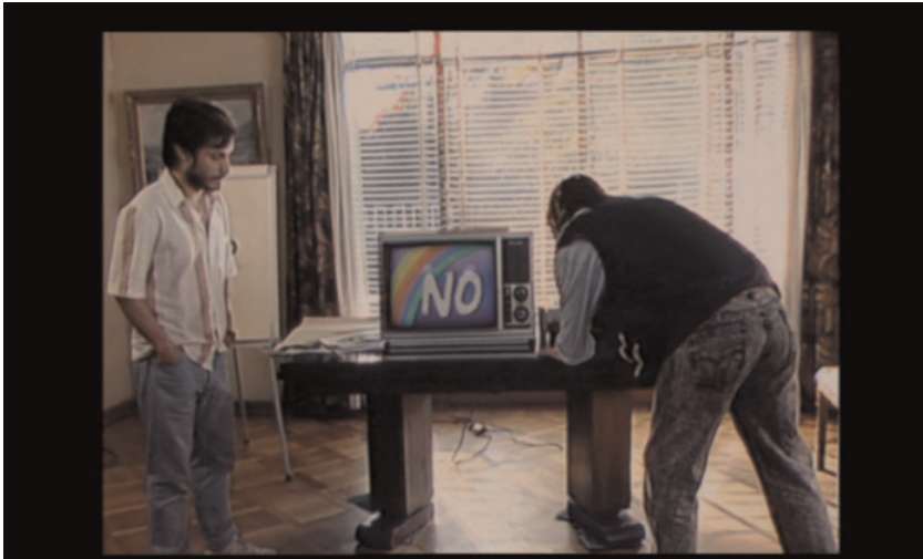
Fig. 1: Advertising executive René Saavedra (Gael García Bernal) in No .

As mentioned before, these effects are usually created by digital manipulation, but it is not unusual that they are obtained through the adoption of old technologies. This is the case of films shot partially or entirely with old camcorders or on 16mm, for instance Andrew Bujalski's Computer Chess (2013), a period comedy about a chess tournament for computer programmers shot with a Sony AVC-3260, an archaic tube video camera used in the 1970s. Pablo Larraín's No (2013) is another interesting example. Described in Sight and Sound as 'a vintage piece of challenging agitprop', 26 the docudrama on the advertising campaign to reject Pinochet's rule in 1988 Chile was shot in the U-matic video format to give its dramatic material a further layer of authenticity.