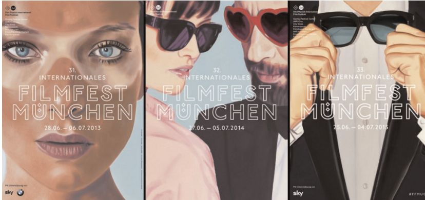
Fig. 1: Filmfest München Poster 2013, 2014, 2015