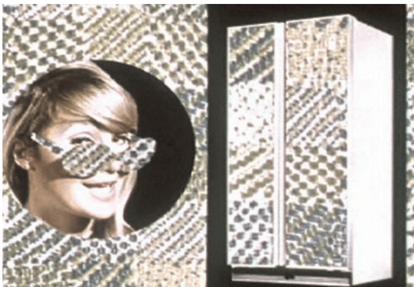
Intermittent Delight (Akosua Adoma Owusu, 2007)

– but the final suggestion is infinitely more powerful. Smashed irrevocably to smithereens, Century envisages the end of an era to allow for the beginning of another, a scrap heap from which something totally new might emerge.