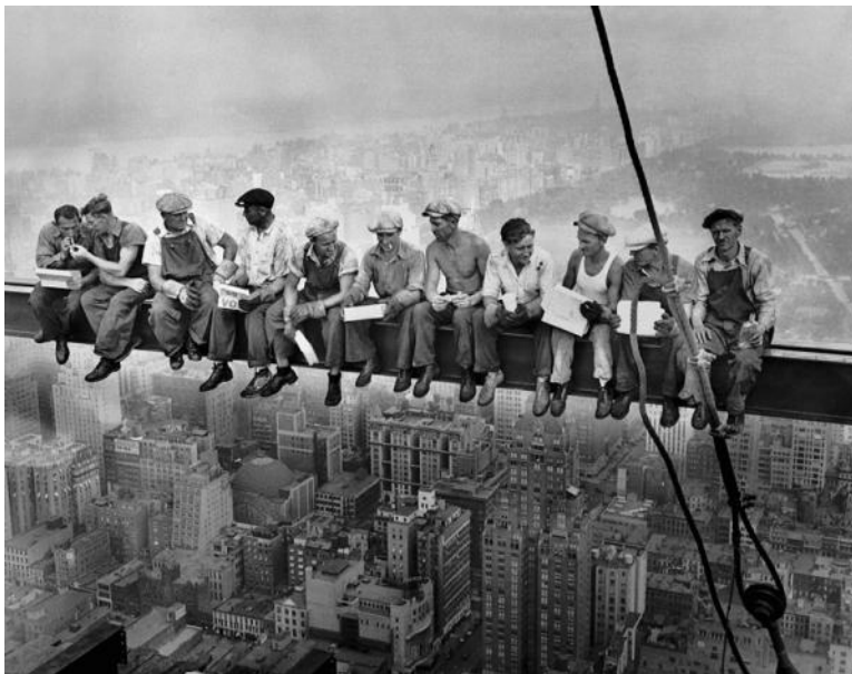
figure 2: Charles C. Ebbets, NY, Construction Workers Lunching on a Crossbeam (1932), © Bettmann/CORBIS.

In view of this and similar events occurring in the ‘hearts’ of our cities, the following question may be raised to introduce what will follow as essay: what if these bodies on a crane in Brescia succeeded in invalidating the aesthetic tradition that was so magnificently framed by Charles C. Ebbets’ photograph New York Construction Workers Lunching on a Crossbeam (1932)? And, what if they eventually liberated us from our obsessions with the splendeur of the modern metropolis? What are we to discover beneath our feet, in the basements of our supposedly democratic dwellings?