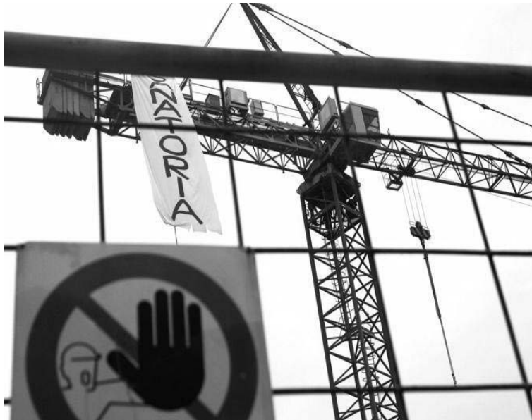
figure 1: Global project—a “few refugees” on a crane in Brescia, http://www.globalproject.info

Pakistan, Senegal, Egypt, and Morocco climbed on a crane located at Piazzale Cesare Battisti, right in the center of the Lombard city of Brescia, and publicly went on hunger strike (see the blog of Senza Frontiere , http://senzafrontiere.noblogs.org/ ). In the midst of all those scenes of social unrest, police repression, and the extensive media coverage that followed, four of them held out for sixteen days, until they finally ended their hunger strike on November 15th, descended from the crane, and surrendered to the Italian authorities. As a political act, this hunger strike might not have “reached the decisive point in the political” Carl Schmitt so fervently imagined in his book Der Begriff des Politischen (2007, p. 39). Still, it has effectively disturbed the very sense of location and territory upheld by nationals and may be considered an incisive act of emergent politics.