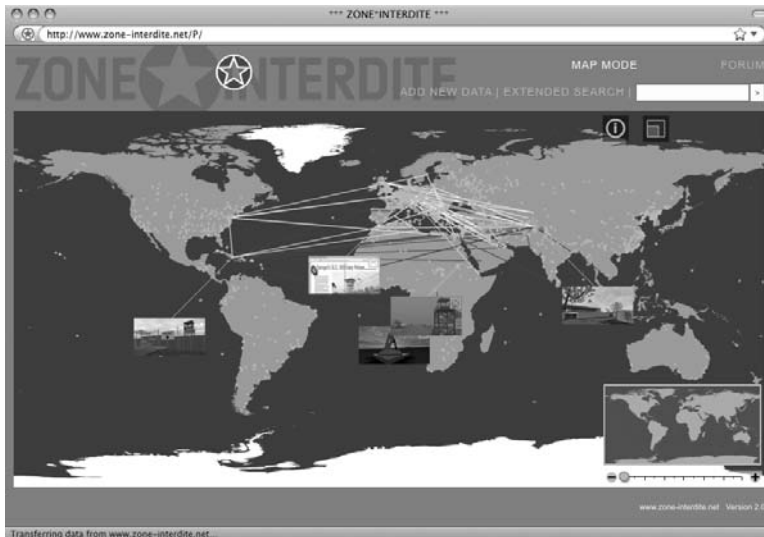
figure 4: Christoph Wachter, Mathias Jud, zone*interdite, www.zone-interdite.net

all please and appease shoppers' desires. In Wachter and Jud's words: "When observing military restricted areas, our attention got blurred" (ibid.). While the Transborder Immigrant Tool was conceived to disturb the hegemonic administration of borderscapes and to incise alternative parcours through nationalized territories, zone*interdite serves mainly as a corrective device, as an open 'archive' that allows for reframing a strategically distorted imagery.