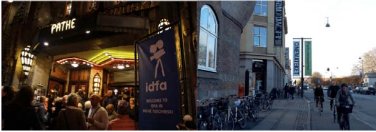
Fig. 1: The main venues at IDFA (Pathé Tuschinski Cinema) and CPH:DOX (Cinemateket: Danish Film Institute).