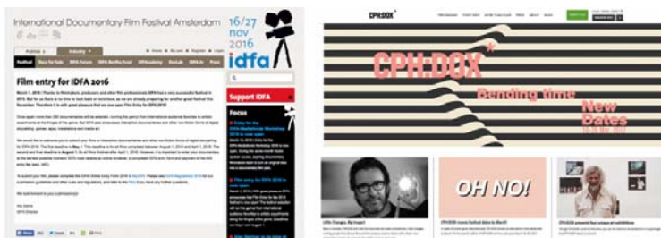
Fig. 2: Official websites of IDFA and CPH:DOX announcing upcoming dates for the next editions.

Many professionals present at CPH:DOX were travelling directly to IDFA. The number of Canadian and US delegates in Copenhagen was remarkable, including representatives of Hot Docs Documentary Film Festival (Toronto, Canada) and South by Southwest (Austin, USA). The specialised circuit is not the only reference for documentary professionals as they also travel to major events or A-list festivals. After the mandatory appointment at IDFA many follow to Sundance, Rotterdam, and Berlinale, which take place between January and February.