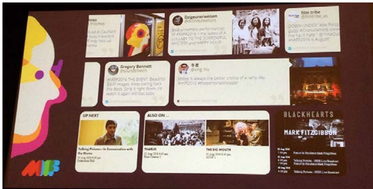
Fig. 1: Social media in the cinema at MIFF 2016, Forum Theatre.

ture, and follow the event’s official Twitter, YouTube, Facebook and Instagram feeds (which appeared on the big screen prior to each film presentation), the festival app highlighted the growing awareness that ‘being there’ is no longer the peak level of audience participation – rather being part of an event now requires a level of documentation and reportage as well.